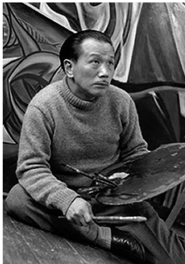
Fig. 1. Okamoto Tarō pictured in 1953.

The way in which Okamoto wrote about the Jōmon nevertheless contained an inherent ambivalence. His ideas could nurture a new critique of Japanese identity or they could renegotiate the old tradition that had been tainted by the war. As with all ideologies, both could happen at the same time. In the 1950s, architect Tange Kenzō (1913-2005) became the most influential public figure to build on the radical idea of Jōmon and Yayoi as two contrasting elements of the Japanese past, elements which could now be employed to shift the negative associations of Japanese tradition away from nationalism and imperialism. Tange's wartime projects had already attempted to go beyond Western modernism through the incorporation of classical Japanese