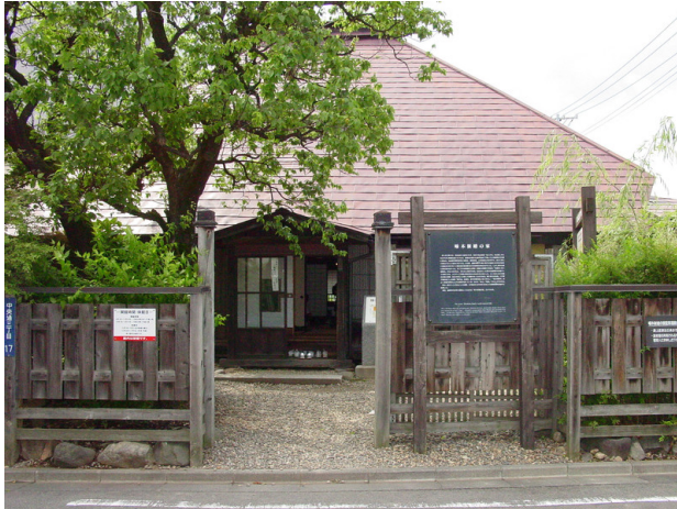
Majestic Mount Iwate. Takuboku's classroom at Shibutami Primary School. The house in Morioka, Iwate, in which Takuboku and his wife first lived together.

Miyazawa Kenji, in that sense, is a much freer traveller. He is generally ecstatic when “on the road.” He is not always drawn home. Kenji looks outward to discover the world; Takuboku looks inward to discover the world. Both poets, however, are deeply affected by their own agitated mental state when they write. Both find joy in sadness and sadness in joy.