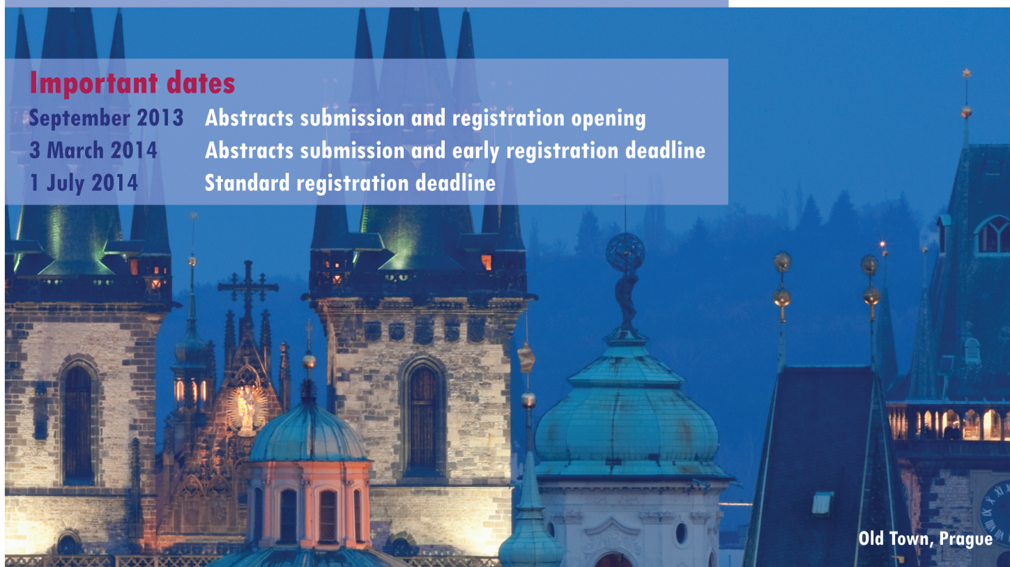
Old Town, Prague