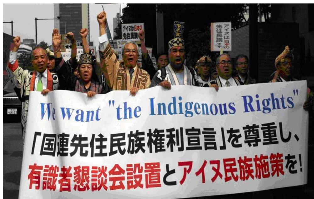
Tokyo: Mass Ainu March for Indigenous Rights, May 22, 2008

Adopting DRIP in September 2007 prompted a series of more aggressive-than-usual initiatives by Ainu organizations across Japan which gained momentum toward July and the opening of the G8 summit. In early 2008, the Tokyo-based Ainu Utari Liaison Group organized a petition drive in downtown Tokyo. [22] In May 2008, they delivered upwards of 6600 signatures to the Prime Minister together with the following requests: 1) that Ainu be recognized as indigenous peoples, 2) that the government issue an official apology to Ainu people, 3) that a nationwide survey of Ainu living conditions be enacted as a precursor to implementing a national policy; 4) that the Ainu Cultural Promotion Act (1997) be reviewed; 5) that a new Ainu/ethnic law be implemented; and 6) that a commission of inquiry be set up to design this Ainu/ethnic law. If the mounting domestic pressure were insufficient, international society added its own support in mid-May. During the Universal Periodic Review of Japan, member states in the UN Human Rights Council’s Working Group recommended the Japanese government initiate dialogue with Ainu and undertake a review of land and other legal rights of Ainu people as steps toward implementing DRIP in Japan. [23]