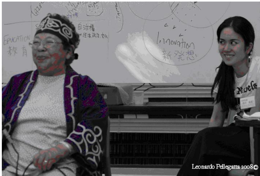
Ukocaranke on Education: Workshops lead to intergenerational discussion

languages,” and indigenous peoples need bi- or tri-cultural interpreters who are skilled in one or more of the colonial languages and their own language to facilitate enhanced communication between all parties.[46] This is not now a central issue for Ainu persons as speakers of Ainu language, as all Japanese Ainu are now fluent in Japanese, and those who do speak Ainu as heritage speakers or are self-taught, are not sufficiently fluent in English or other “colonial languages” to negotiate all three linguistic domains. One positive outcome of the IPS is that younger Ainu organizers are now considering study abroad with newfound indigenous comrades overseas.