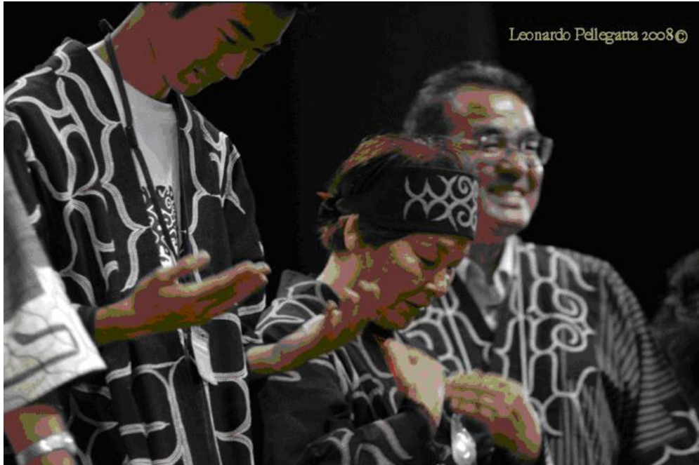
Gestures of thanks from the Executive Council at IPS Start