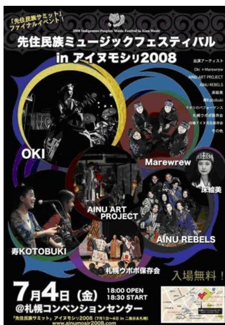
Indigenous Music Festival in Ainu Mosir 2008 poster (Design: W. L. Ding-Everson)

climate change, the global food crisis, high oil prices, increasing global poverty, and escalating violence around the world are all symptoms of growth-based economic models promoted by G8 nations and are therefore fundamentally unsustainable. The declaration urges non-signatory nations to approve DRIP immediately and asks that indigenous peoples be included in future climate talks and assessments to evaluate the impact of climate mitigation measures. Both documents were submitted to the Ministry of Foreign Affairs for distribution to G8 leaders and posted online. With these appeals now circulating globally, IPS organizers have now begun focusing specifically on recommendations to the government-established Expert Meeting in Japan, because this panel will determine future Ainu policy by July 2009. They will also continue to strengthen international ties established through the IPS to hold the Japanese government accountable to Ainu and fellow minority communities across Japan, and to indigenous peoples worldwide.