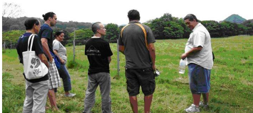
Maori delegation offers a prayer in respect for cinomisir and Ainu ancestors

In Biratori, the dam issue has been especially divisive within the Ainu community because many residents see these public works projects as deliverance from a sluggish economy and rural depopulation while a minority is concerned about cultural and environmental sustainability locally. Biratori Dam construction will necessitate submerging three sacred Ainu sites ( cinomisir ), 17 archaeological sites, and destroy habitat for Ezo Brown bears, an endangered species of falcon, and wild mountain vegetables which have sustained Saru River Ainu communities for centuries. The proposed Biratori Dam was also a focal point of the Environment workshop. During the IPS fieldwork program, a local Ainu elder led a tour of the dam construction site.