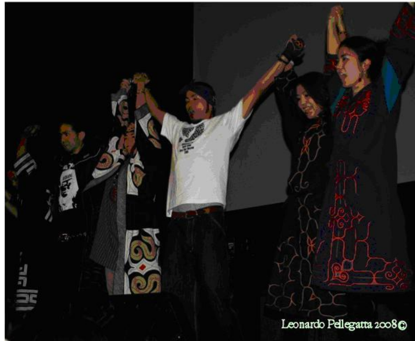
Resistance music: Ainu Rebels blend hip-hop and electronica to create a new Ainu vibe