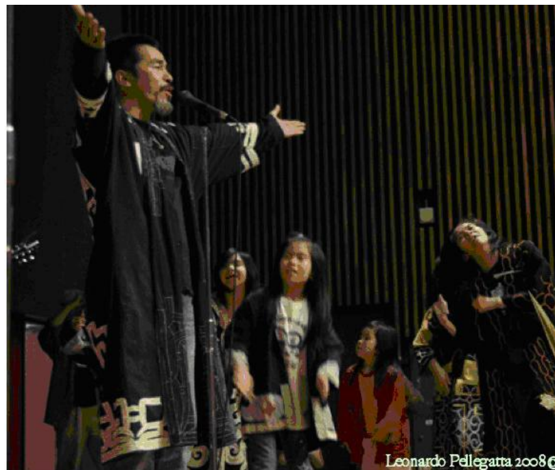
Ainu rock in the family: Ainu Art Project performs traditional songs with hard rock beat