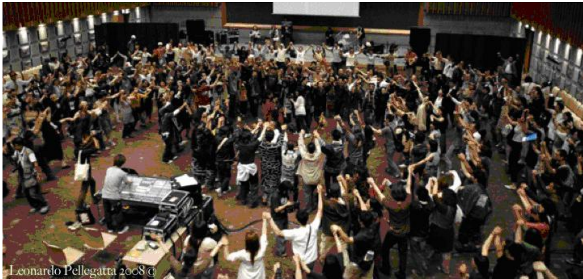
Drawing everyone into the circle: Giant Pororimse dance at IPS Finale