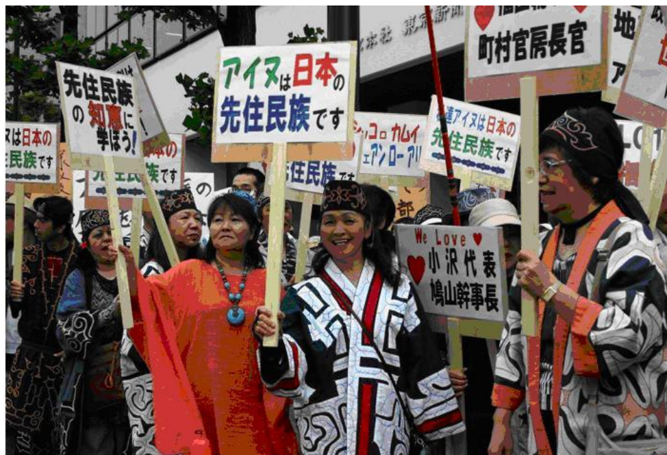
Ainu Women: A vocal majority for indigenous recognition

The Ainu Association also piloted initiatives that were reminiscent of campaigns to support the proposal for the “Ainu New Law” in 1984, which was substantially revised and adopted as the Ainu Cultural Promotion Act (1997), Japan’s first multicultural legislation. Focusing initially on Hokkaido legislators and later expanding to national coalition party leaders, the Association orchestrated visits to legislators, recruiting lawmakers to Ainu political rights work. In March 2008, their efforts bore fruit when the “Legislative Coalition to establish Ainu People’s Rights” was established to push for a resolution “recognizing the Ainu’s pride and dignity as indigenous peoples” ahead of the G8 meetings in July. [24] On May 22, the association coordinated a march on the nation’s capital, attended by more than 400 Ainu from across Japan. Adorned in traditional kimonos and waving placards anticipating the G8 environmental theme, “Ainu are kind to the earth” and “the Earth is on loan from our children,” the group marched toward the Diet buildings. Here Ainu Association directors formally read and delivered a formal request for indigenous rights to assembled lawmakers.