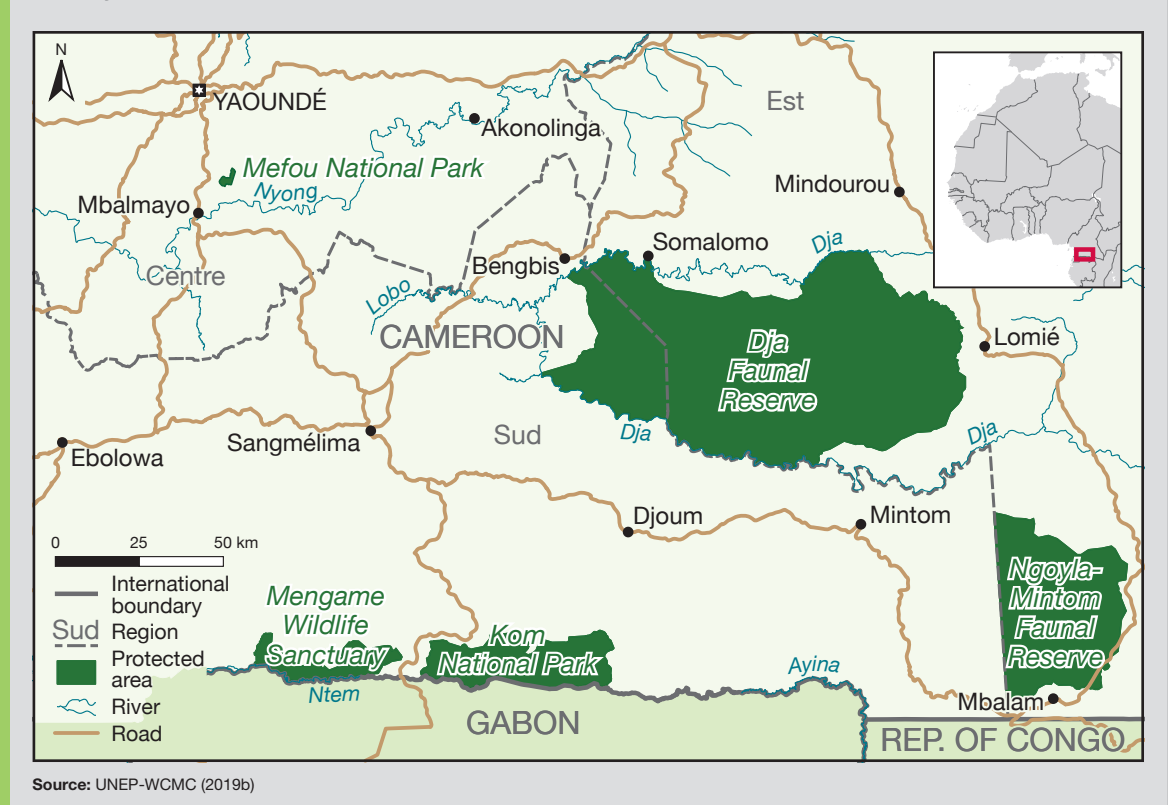
FIGURE 3.1 The Dja Faunal Reserve and Environs, Cameroon

The hunters in this study comprised both opportunistic and specialized hunters, helped to varying extents by porters. Carriers included drivers of logging trucks, buses, taxis and private cars; some provided information about illicit means of traversing checkpoints, such as relying on the complicity of wildlife officials at checkpoints and the impunity of passengers and drivers of certain registered vehicles. Traders including wholesalers and retailers—typically work in markets and restaurants, but they also sell from home; most of them partake in other activities, such as agriculture or bee farming. Traders can buy directly from hunters or from middlemen. Many middlemen are forestry officials who can be motivated to supply politicians and other members of the elite, and who consequently enjoy some level of impunity. Consumers, who can buy from hunters, middlemen or traders, are the final link in the chain. The part of the chain in which meat is being traded varies in length depending on the number of