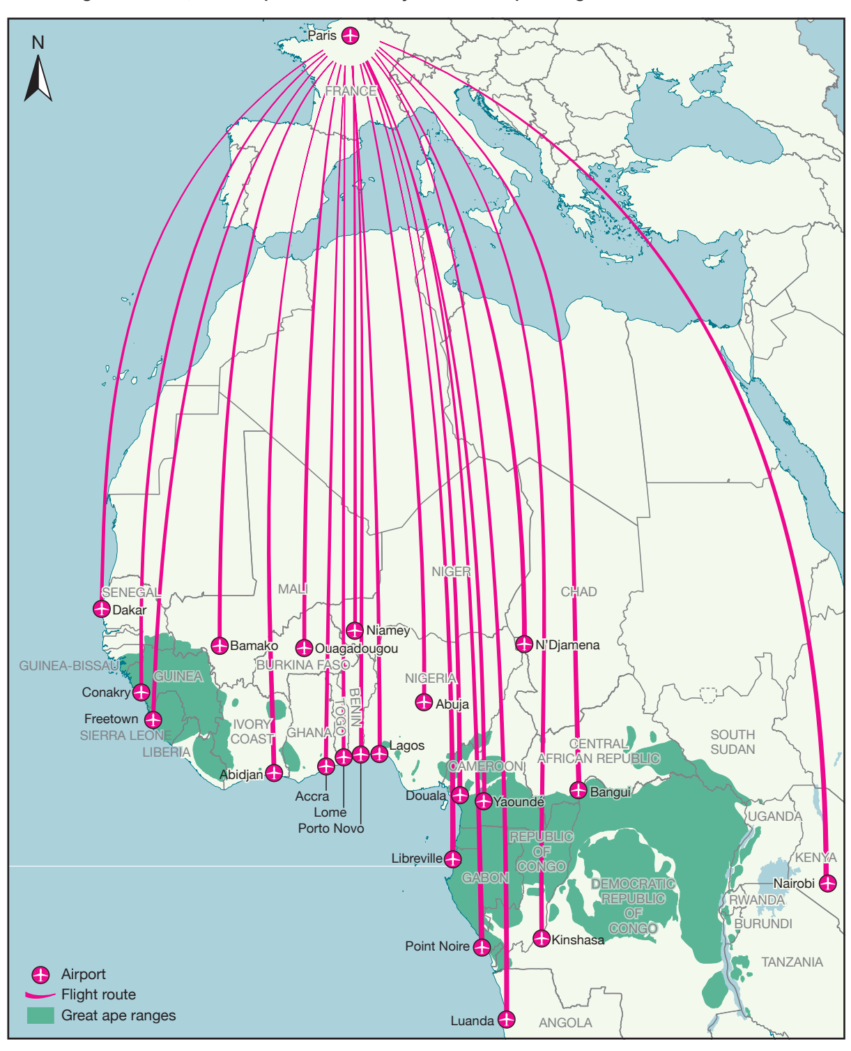
FIGURE 3.3 Direct Flights to Paris, from Airports in Proximity to African Ape Ranges