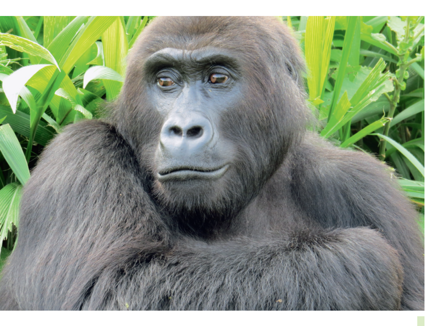
Photo: Grauer's gorilla populations, in their stronghold of Kahuzi-Biega National Park, DRC, declined by 87% from 1994 to 2015, mainly due to hunting, although the trend was exacerbated by civil conflict. Grauer's gorilla at the Gorilla Rehabilitation and Conservation Education Center (GRACE), DRC.

In the northeastern Republic of Congo, nearly 7% of chimpanzees and 5% of gorillas may have been removed annually, from already low population densities of about 0.3 chimpanzees per km² and 0.2 gorillas per km². In contrast to other species that are pursued for their meat, great apes typically have low reproductive rates, which means that even low hunting pressure can lead to catastrophic population decline. Indeed, an annual offtake of 5–7% implies that the studied chimpanzee and gorilla populations were likely to be halved within 11–15 years—clearly an unsustainable rate (Kano and Asato, 1994). Even when hunting offtake diminishes