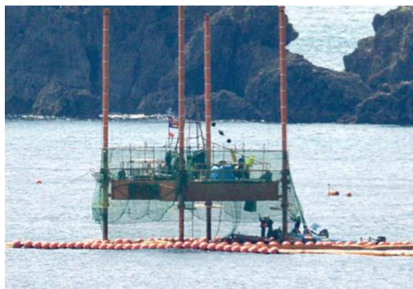
Ocean Floor Drilling Rig, Oura Bay, 13 March 2015

Onaga's hesitant moves on the Henoko (and Takae) fronts contrasted sharply with Abe's decisiveness. Watching with pain and disbelief early in 2015 as the Abe government proceeded to drop huge, coral crushing, concrete blocks, each between 10 and 45 tons, across Oura Bay to mark the outline of the reclamation site, to let works-related contracts, prepare and dispatch materials, and harass, beat, and arrest protesters, many who had been among Onaga's enthusiastic supporters just months earlier, were shocked.