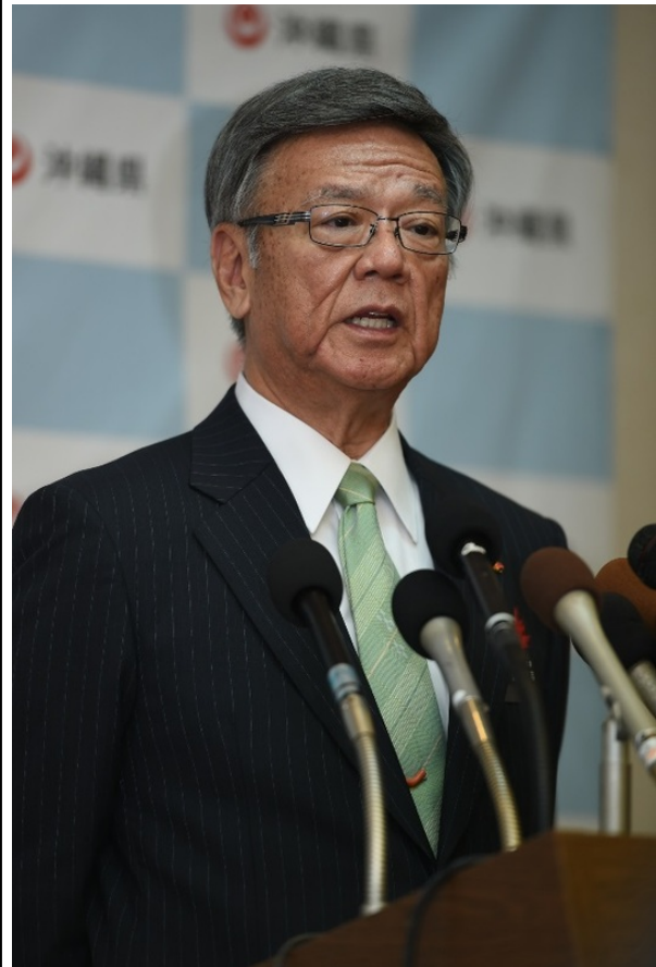
Governor Onaga on Assumption of Office, 10 December 2014

and therefore abandon the project to impose upon them one more massive military installation.