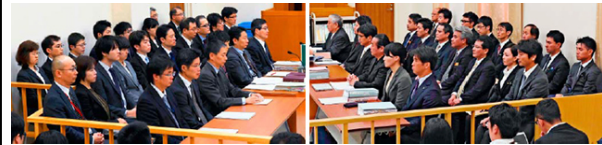
Lawyers representing the state (left) and Okinawa (right) in court, February 29, 2016.