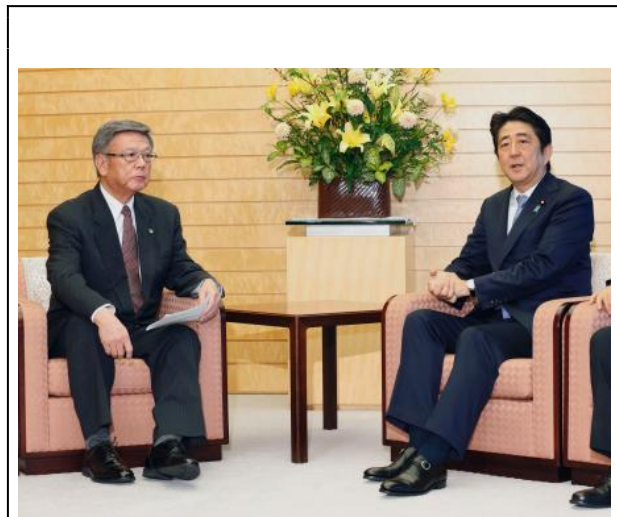
Announcement of "Amicable Agreement," March 4, 2016.

would discuss and seek "satisfactory resolution" pending the final outcome of judicial proceedings, and both would then abide by that final outcome; in other words, the Governor would promptly carry out whatever the court ruled, even if he thought it wrong, and would revoke his October 2015 order without further ado.