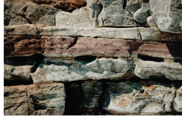
Fig. 9. Paganea: Makrya Mounda quarry with ancient wedge holes.