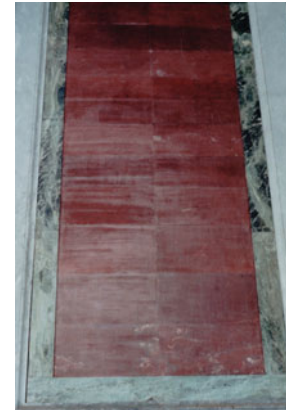
Fig. 26. San Paolo fuori le Mura, Rome. Exterior west wall, rosso antico composite panel.