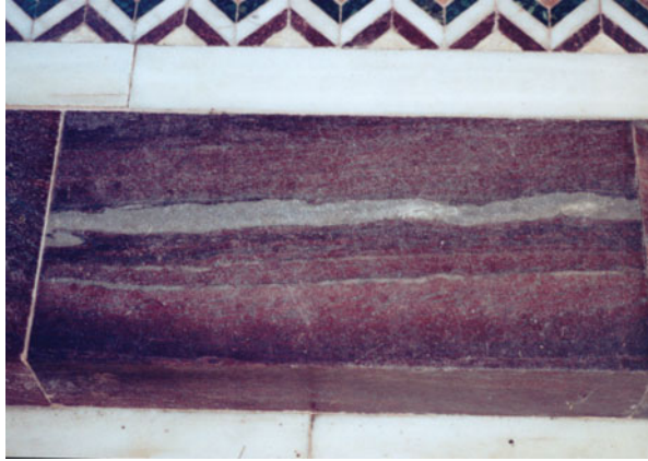
Fig. 18. St Catherine, Hoarwithy. Rosso antico communion rail step.