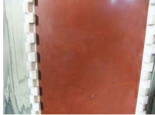
Fig. 24. Westminster Cathedral, London. North transept pier with rosso antico cladding panel.