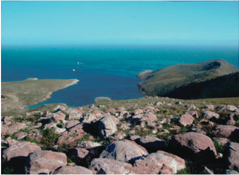
Fig. 3. Mianes: Agriokambi rosso antico deposits (foreground), Kisternes Bay (centre), Tainaron-Cape Matapan (right). View from northwest.