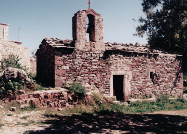
Fig. 7. Church of Prophetes Elias, with quarry to left.