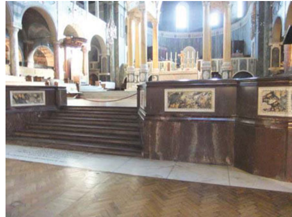
Fig. 22. Westminster Cathedral, London. Sanctuary screen and steps.