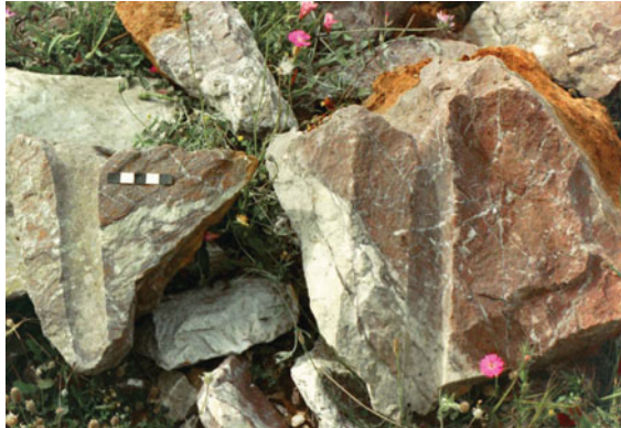
Fig. 6. Mianes: Agriokambi, rosso antico quarry blocks with modern drill holes (scale 5 cm).