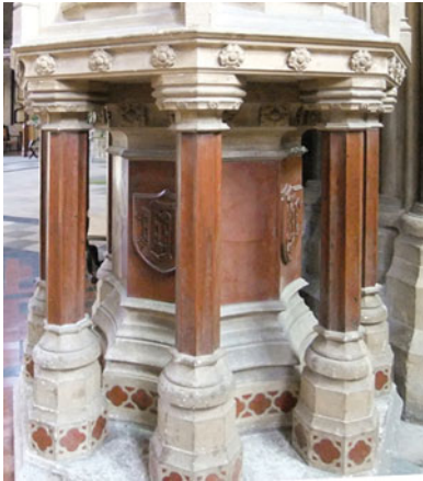
Fig. 25. Bristol Cathedral. Pulpit.