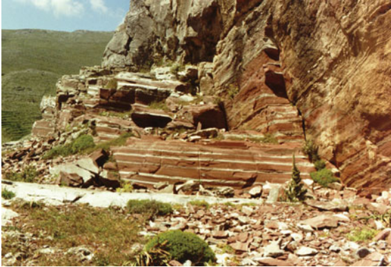
Fig. 11. Prophetes Elias – highest quarry (Moschou et al. 1998, fig. 2 Quarry B) with modern long vertical drill holes at centre and left on main face.