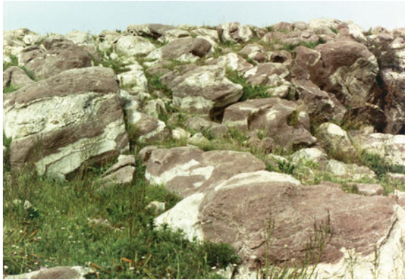
Fig. 4. Mianes: Agriokambi rosso antico quarry.