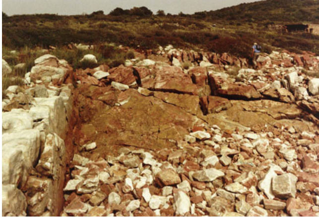
Fig. 14. Paganea: Ligorianiko modern quarry. View from west.