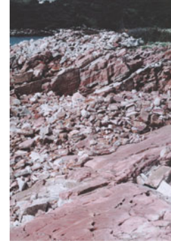
Fig. 15. Paganea: Ligorianiko modern quarry and waste heap; Langadhaki inlet (top left); Giannopoulos house on Makrya Mounda (top edge). View from south.