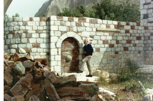
Fig. 12. Alike. House under construction.