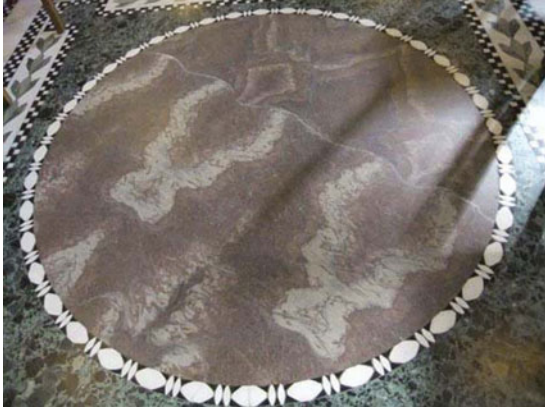
Fig. 23. Westminster Cathedral, London. Lady Chapel, circular panel of floor.