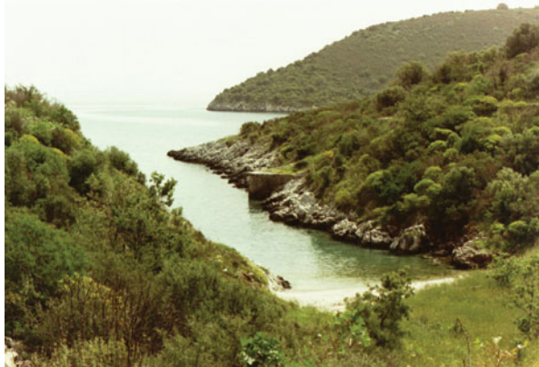
Fig. 16. Paganea: Geogariou overgrown quarry (right centre) and loading jetty (centre). View from northwest.