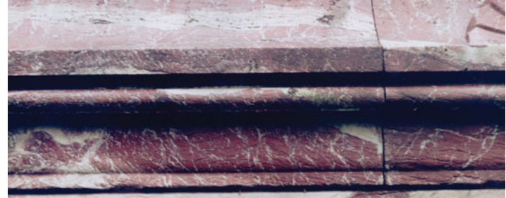
Fig. 20. Statue of Byron, plinth upper moulding.