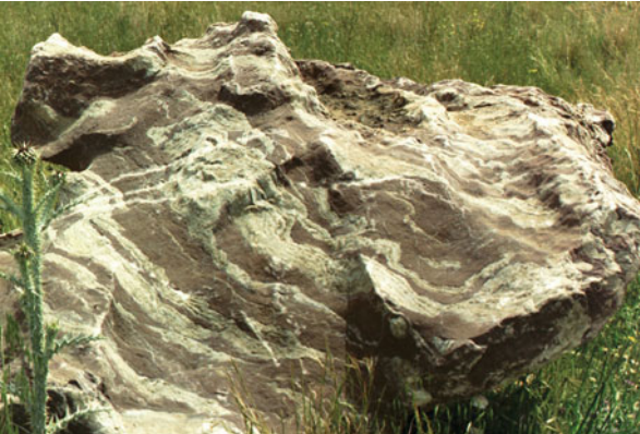
Fig. 5. Kokkinogeia rosso antico boulder.