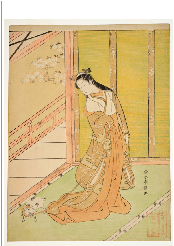
Suzuki Harunobu, Princess Sannomiya (Third Princess from the Tale of Genji ), circa 1766. Honolulu Museum of Art; WikiCommons .

ugly not only because they were regarded as “outsiders” but because they were “people of lower standing” than the Chinese.