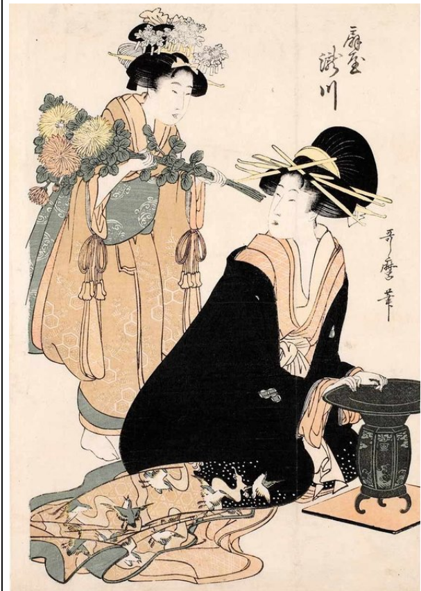
Kitagawa Utamaro, The Courtesan Takikawa of the Ogiya Brothel Accompanied by her Kamuro, 1801.

The absence of universal standards for physical beauty was recognized early on along with the discovery of "the intercultural." Ever since Darwin stated, "It is certainly not true that there is in the mind of man any universal standard of beauty with respect to the human body," 1 many researchers have made the same point. Claude Lévi-Strauss, who observed the body drawings of the Caduveo tribe in Brazil and described them in Tristes Tropiques (1955), conjectured as to why many men belonging to other tribes came to settle and marry Caduveo women at Nalike: "Perhaps the facial and body paintings explain the attraction; at all events, they strengthen and symbolize it. The delicate and subtle markings, which are as sensitive as the lines of the face, and sometimes accentuate them, sometimes run counter to them, make the women delightfully alluring." 2 When he wrote this, the aesthetics that greatly differed from Western sense of beauty did not shock his readers. In their daily lives, however, most people still believe that essential physical beauty exists universally.