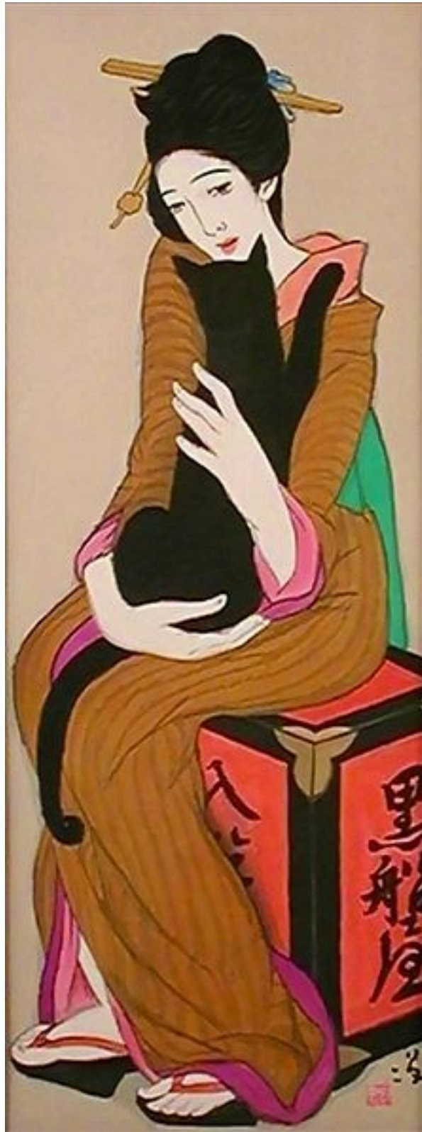
Takehisa Yumeji, Kurofuneya (Black Ship Inn), 1919. Takehisa Yumeji Ikaho