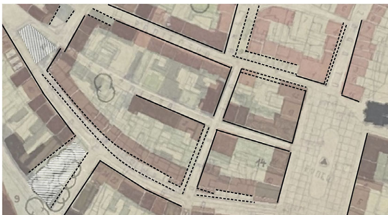
Figure 7. Fragment of the overlay of the 1952 reconstruction plan and the 1949 ‘record of destruction’ showing Rzeźnicza Street in the middle of the picture and the Main Square on the right. The solid lines show the unchanged building lines, the dashed lines show the change of the planned alignment lines. The shaded polygons show the quarters to be demolished. ‘Racibórz, inwentaryzacja urbanistyczna Starego Miasta, stan zniszczeń’, 1949, 45/224/0/67/6109, Archiwum Państwowe w Opolu; ‘Racibórz, [wysokość zabudowy]’, 1952, 45/224/0/67/6105, Archiwum Państwowe w Opolu.

Using the war’s destruction to ‘resurrect’ the past was not unique to Racibórz. In particular, post-war ‘correction’ of façades to create a desirable image of the city was quite common. 68 Many cities, including Saint-Malo in France, were reconstructed in an historical fashion, but with some ‘adjustments’ for the needs of modern housing, and making it somewhat friendlier towards cars. 69 We can clearly see it in the case of Racibórz (Figure 7). While building lines in the Main Square remained unchanged and this was also the case for some smaller streets, others were planned for a major reshaping. It is very clearly visible in the case of Długa Street; its north side was to be set back, thus widening it. Considering that the old town was planned as a housing estate, it was more to do with the quality of apartments (especially provision of sunlight in the flats), than the needs of motorized traffic. It could be argued that those changes were intended to provide a more ‘legible’ city plan as well as a more ‘unified’ image of the streets.