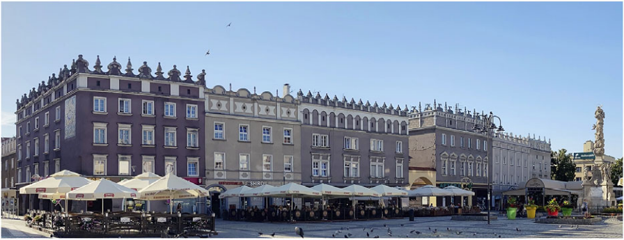
Figure 1. The western side of the Main Square in Racibórz from the early 1950s.