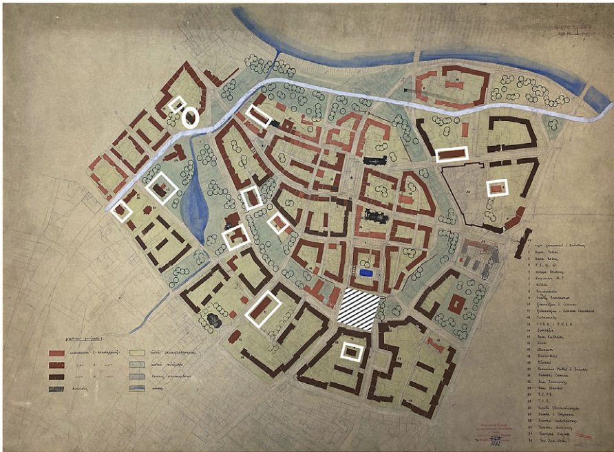
Figure 3. 1952 reconstruction plan of Racibórz. In white frames, educational institutions (i.e. kindergartens and primary and secondary schools) are highlighted. The seat of the Communist Party is in the white circle. The square for political demonstrations with the May Day tribune is marked using white and black stripes. 'Racibórz, [wysokość zabudowy]', 1952, 45/224/0/67/6105, Archiwum Państwowe w Opolu.

their shape and size. This is very visible if we compare planned buildings in the historic centre with the ones planned outside the green belt, which are much more regular (Figure 3). None of the perimeter blocks were to be fully sealed; the degree of their openness to the streets varied. With only a few exceptions, the plan foresaw placing buildings directly on street lines, without any front gardens. 49