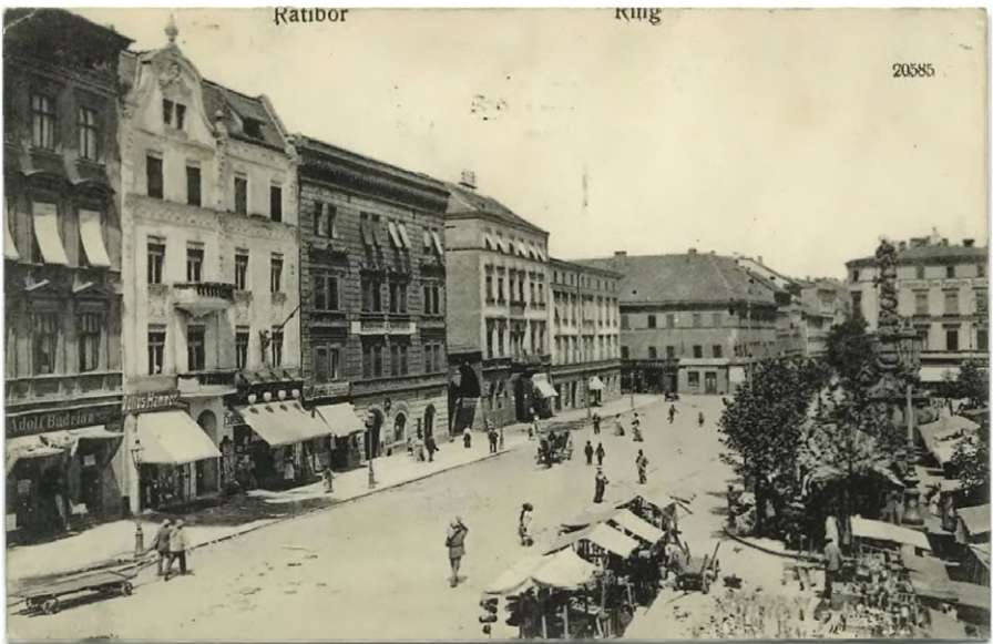
Figure 2. The western side of the Main Square in Racibórz on a 1906 postcard: Reinicke & Rubin, Magdeburg, Biblioteka Śląska, Katowice, ŚIBZZ, Sig. PA 594, public domain.

understood as the beginning of this period in Poland. 10 The socialist cities were to be built on the Soviet model while ‘avoiding a number of errors detected and overcome in the USSR’. ‘Socialist content in national form’ was to be strived for. This could be achieved, according to Goldzamt, by establishing ‘continuity between the old architecture and the new based on adopting, processing and developing healthy and progressive traditions, while rejecting bad and reactionary ones’. Modernism, the