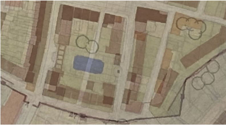
Figure 5. Overlay of the 1952 reconstruction plan and the 1952 ‘historical study’ showing the southern edge of the historical centre. A green courtyard with a pond (blue rectangle) was planned on the site of a medieval street. ‘Racibórz, studium historyczne’, 1952, 45/224/0/67/6102, Archiwum Państwowe w Opolu; ‘Racibórz, [wysokość zabudowy]’, 1952, 45/224/0/67/6105, Archiwum Państwowe w Opolu.

(see Figure 4). Second, in the southern part of the historic city, south from the city church, where according to the ‘historical study’, a street once existed between the gardens, a new structure was envisaged. According to the 1952 map, a yard flanked from all sides by houses and an arch(?) was to be created with a small pond in the middle. Neither of these corresponded to the pre-war situation (Figure 5). Browarna (Brewery) Street, which according to Dziewoński did not exist in the fifteenth century, was retained, as it existed in the modern city. Moreover, the greenery of the medieval period was replaced partly by the houses along the street. Similarly, the eastern part of the historical core, which supposedly was largely undeveloped in the medieval period, was not left empty, but was planned in a similar fashion to that on the western side. Finally, there was no plan to reconstruct the city hall in the middle of the Main Square. The Renaissance city hall building was demolished after the city fire in the eighteenth century and a new building in a classical style was not erected until 1825 in a different location on the Main Square. 60