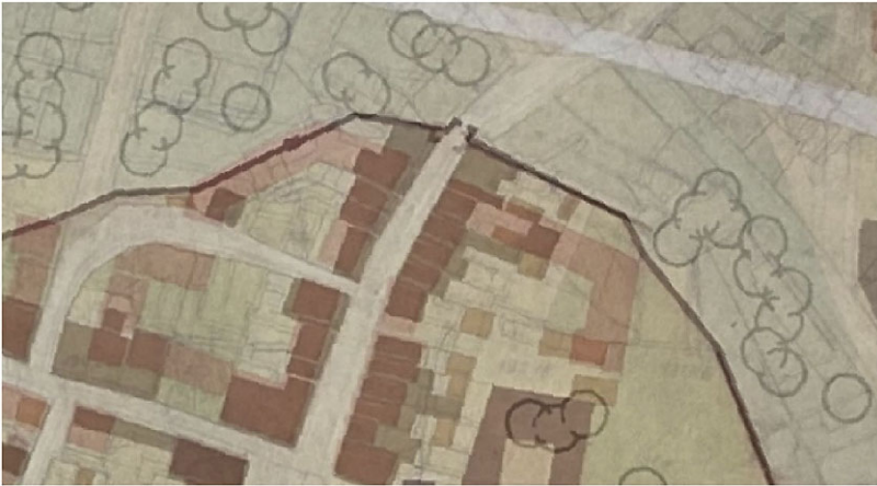
Figure 6. Fragment of the overlay of the 1952 reconstruction plan and the 1952 'historical study' showing Orzanska Street in the middle of the picture. Planned houses on the right along the city wall. Some sort of city gate was planned, and no buildings were envisaged beyond this point. The circles symbolize the trees/plants. 'Racibórz, studium historyczne', 1952, 45/224/0/67/6102, Archiwum Państwowe w Opolu; 'Racibórz, [wysokość zabudowy]', 1952, 45/224/0/67/6105, Archiwum Państwowe w Opolu.

gate, and along the western part of the green belt. Next to Odrzańska Street, the outside wall of a newly built house also follows the course of the city walls. Moreover, according to maps, no buildings were to stand beyond the line of the medieval walls. Those that were left after the war were to be demolished (Figure 6). Surrounding the historical core with a green belt was hardly a solution unique to Racibórz. On the contrary, it was commonly used in post-war Poland and was seen as the preferred solution in many cases. This urban strategy had been used throughout Europe since the nineteenth century and can be still found in many places today (e.g. Vienna, Würzburg, Cracow). 62