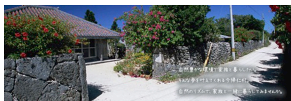
Traditional home in Nakijin Village

On arriving in Nakijin, we discovered that the houses in our little Imadomari neighborhood had been destroyed. We were told that when the Americans had found Japanese soldiers hiding in one house, all of the small, thatched-roof houses had been burned. Now my father and other men set about constructing shacks for shelter. Ours was right at the seashore and consisted of one tiny room where we lived and slept. My father was a fisherman, but fishing, as well as going out in boats, was prohibited, so we had almost nothing to eat. Farm families had sweet potatoes and some vegetables, but we resorted to collecting seaweed or wild greens by the roadside. Even the seaweed was "trash" seaweed that had washed up on the beach. At times we received limited food rations from the Americans, and my mother used such things as flour or small amounts of corned beef hash to make soup or dumplings.