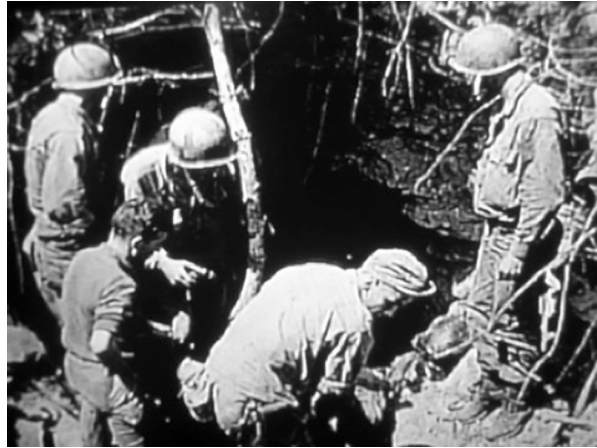
American soldiers at the mouth of an evacuation cave