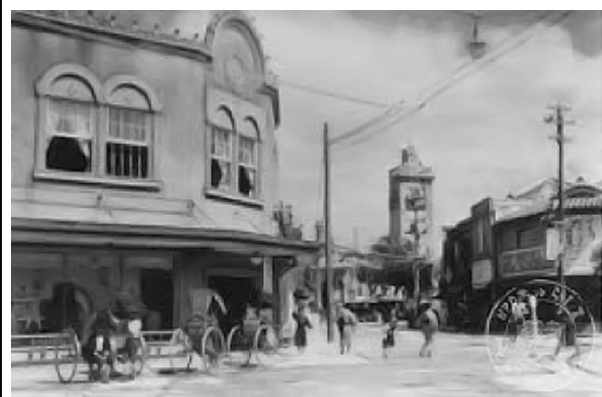
Naha before World War II