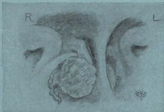
Right Antral discharge seen by Endo-Rhinoscope (DR P. WATSON-WILLIAMS' CASE)

This Endo-Rhinoscope affords an excellent upright view of the regions under inspection; it gives a very wide field and shows the details clearly and in true colour