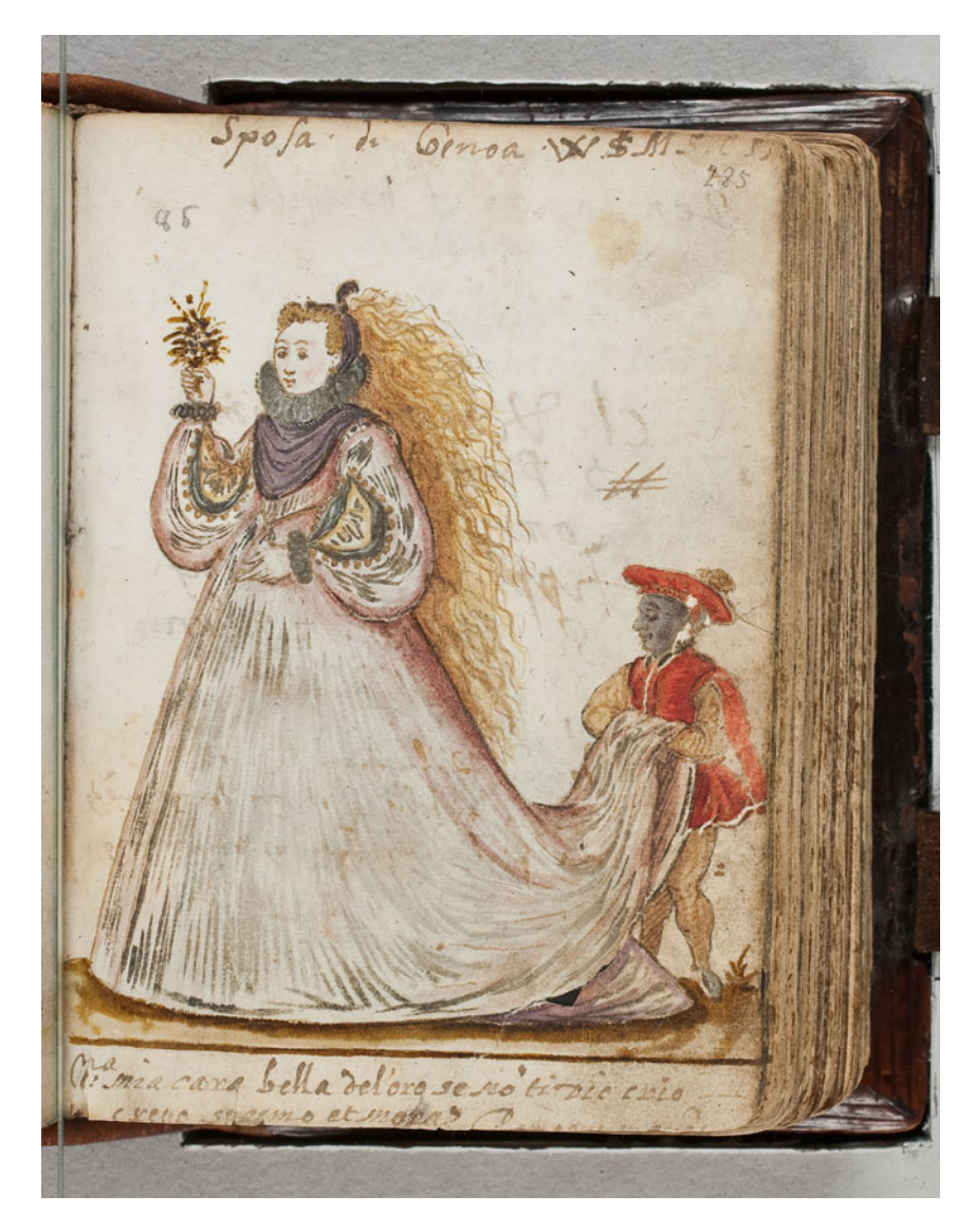
Figure 4. Bernardus Paludanus (1550–1633), Sposa di Genoa in his Album amicorum, fo. 285r, National Library of the Netherlands. Image in the public domain.

including white with rose, yellow, red, or wine-colour ( avinato ). Mixes without white were forbidden, however; these were likely considered immodest and unsuitable for honourable women. Clothing could also be decorated with up to three centimetres of silk lace trim.<sup>58</sup> In a final concession, slashed garments