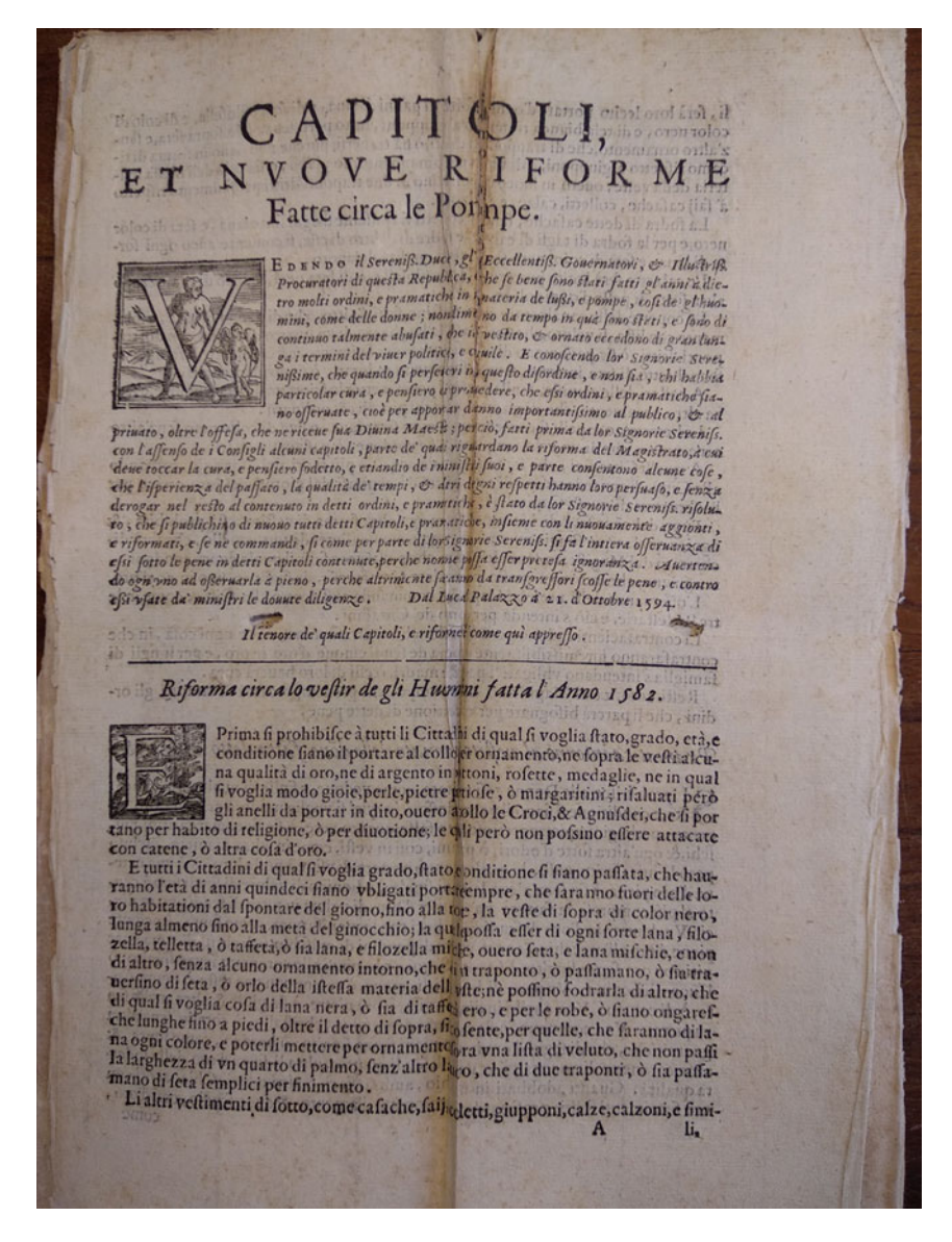
Figure 2. Capitoli et Nuove Riforme Fatte circa le Pompe 1594, Miscellanea del Senato 1069, Senato (Sala Senarega).

as legislation addressed 'all citizens, of any status, rank, age and condition'.<sup>44</sup> Legislation instead emphasized gender difference. As will be discussed below, the laws expose concerns about the perceived deterioration of