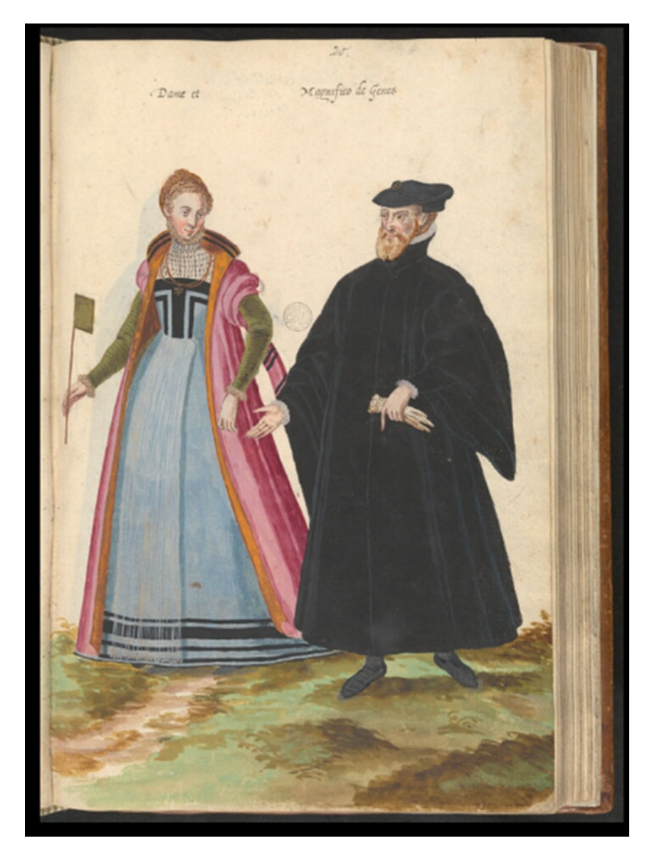
Figure 1. Lucas de Heere (1534–84), Genoese nobleman and noblewoman , in Théâtre de tous les peuples et nations de la terre... , fo. 19r, watercolour illustration, sixteenth century, Ghent University Library. Image in the public domain.

lawmakers were engaged in a fruitless task. Legislation dictated that luxurious clothing was forbidden; yet clothing had become a 'key aspirational good';<sup>38</sup> the wide availability, diversity, and powerful symbolic meaning of clothing