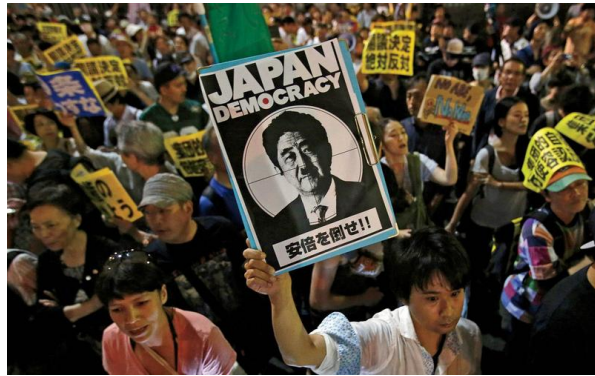
A wave of protest against Prime Minister Abe's call for constitutional revision.