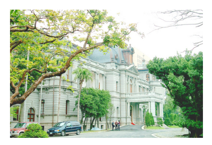
The Taipei Guest House

in September 2006, the DPP government does not mention the 1952 treaty; the sole exception states that the treaty has not settled Taiwan's legal status but that Taiwan has de facto sovereignty. In short, the DDP continues to teach the coming generation that Taiwan's status is not settled. Without using the longue durée interaction between China and Japan to determine Taiwan's historical alignment, as presented in this essay, the significance of the 1952 treaty for defining Taiwan's legal status cannot be fully comprehended.