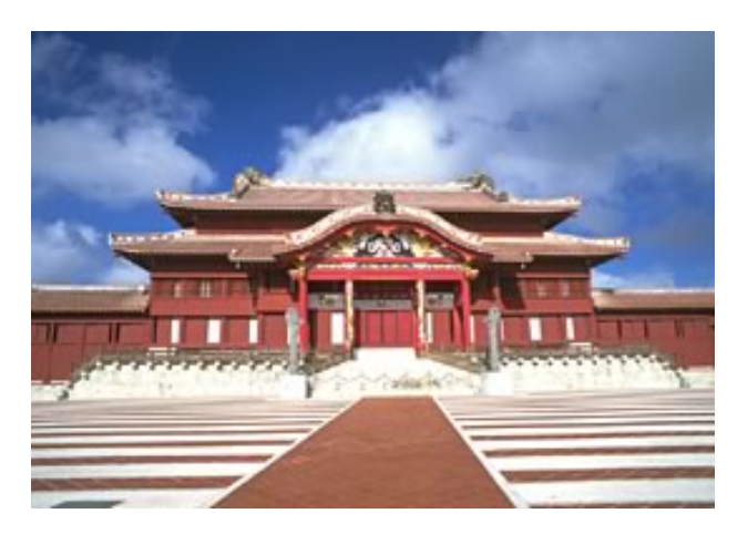
The Shuri castle

Traveling through East Asia, one can view historic imperial palaces in Beijing and Tokyo, and royal palaces reconstructed from the ruins left by fire and war in Seoul and Naha. Okinawa is the largest island in the Ryukyu archipelago. The Shuri palace in its capital, Naha, was constructed more than six hundred years ago by the rulers of the Ryukyu kingdom, which played a crucial role in maritime East Asia from the fourteenth to the seventeenth centuries. Today, it takes barely an hour to fly from Taipei to Naha, and the Shuri castle, reconstructed three times in the last century, has been designated a World Heritage Site in an attempt to evoke its former grandeur.