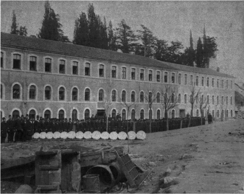
Figure 3. The Boys' Battalions were introduced to overcome the problems associated with the militarization of labor in the Naval Arsenal.