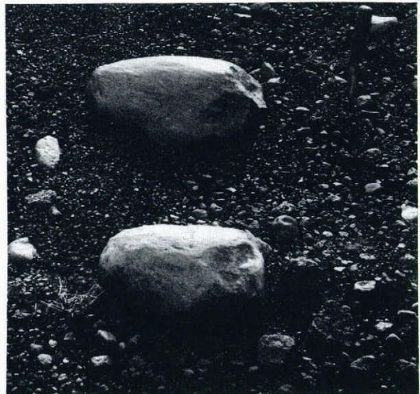
Fig. 1. Clasts with a stoss-lee form embedded in ground moraine in front of Mýrdalsjökull, Iceland. Glacier flow is from left to right. (Photograph 1982.)

The study site is the ground moraine in front of the northern margin of the glacier Mýrdalsjökull,