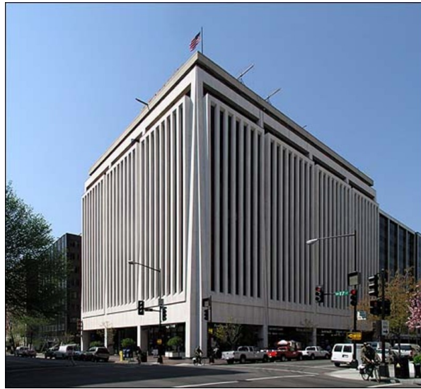
The American Enterprise Institute, Washington, DC. Source

Money, including much new money generated by the Vietnam War, was largely responsible for this change. But as I noted in American War Machine (p.38), the CIA played a hand in promoting Chicago School neoliberalism for application in Chile after the Pinochet takeover in 1973. Since 1981, this program of deregulation has been increasingly applied at home. The result has been a major reversal of the capitalist reforms dating back to FDR in the 1930s and to Theodore Roosevelt before him. Instead we have seen restored the disparities of wealth and income that characterized the “gilded age” of the late 19 th century. I am not arguing that these unhealthy and dysfunctional disparities were consciously intended. On the contrary I argue elsewhere that it was an overreaction arising from the anxieties of the very wealthy in the 1960s and 1970s, an anxiety urgently shared by elements in the deep state, that control of the country was slipping away from them. 43