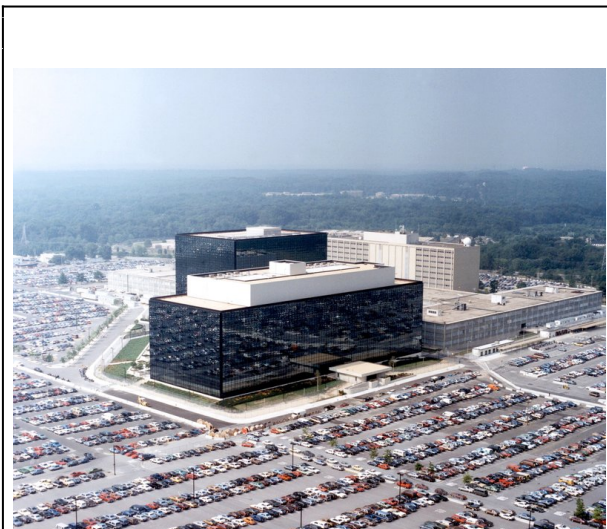
National Security Agency. Source

conservatives; in foreign policy, doves versus hawks. (Yet American liberals when they reach power, such as Hillary Clinton and John Kerry, have also been deeply entwined in the militarization of American politics and its global expansion.) But with the recent expansion since 9/11 of extra-constitutional agencies like the NSA, it is time to supplement these horizontal distinctions with a vertical one: between those agencies constrained by constitutional checks and balances (the public state) and those not so constrained (the deep state). Although the deep state as we have defined it has always existed, its recent radical expansion has brought it into occasional conspiratorial conflict with the public state, even with the president.