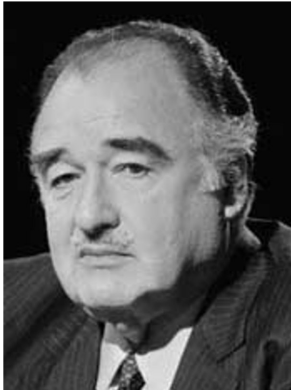
Alexandre de Marenches. Source