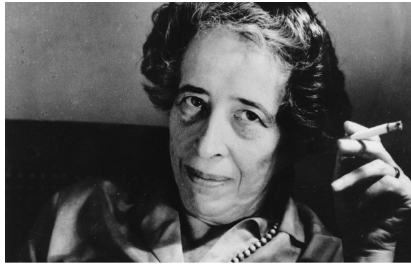
Hannah Arendt. Source

This tension increases, and predictably tips toward violence, if a well-organized open community expands beyond its own borders and is increasingly occupied with the business of supervising an empire. It is repeatedly the case that progressive societies (like America) expand. As their influence expands, their democratic institutions, based at bottom upon persuasive power among equals, are supplemented by new, often secret, institutions of top-down violent power for the control of alien populations abroad, often speaking different and unfamiliar languages. The more the society expands, the more these institutions of violent power encroach upon and supplant the original democracy.