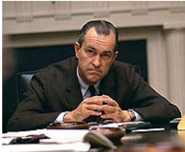
Richard Helms.

The Safari Club was an alliance between national intelligence agencies that wished to compensate for the CIA's retrenchment in the wake of President Carter's election and Senator Church's post-Watergate reforms.