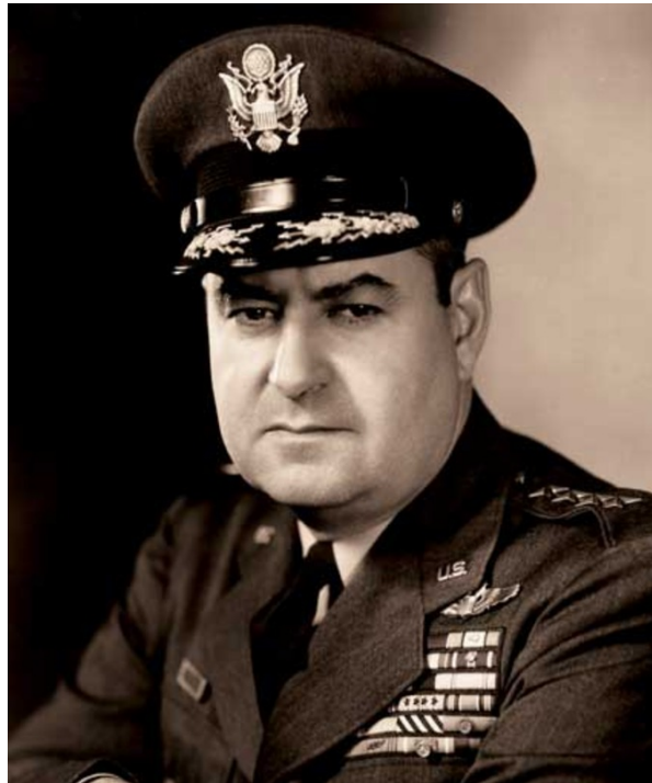
Curtis LeMay. Source

There are abundant corroborations for this alarming standoff between the president and his Joint Chiefs. Daniel Ellsberg, who worked in the Pentagon in 1964, told David Talbot that after the Cuban Missile settlement “there was virtually a coup atmosphere in Pentagon circles ... a mood of hatred and rage. The atmosphere was poisonous, poisonous.” 13 Disagreements over how vigorously to pursue the Vietnam War later divided President Johnson from many of his generals, split his party, and finally persuaded LBJ not to run for re-election.