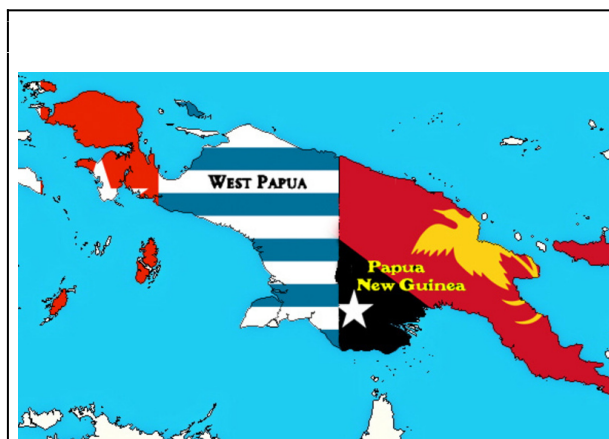
New Guinea island divided between Papua New Guinea and West Papua (or the Indonesian provinces of Papua and Papua Barat). Image credit

spokesperson for Fijian opposition party the United Front for a Democratic Fiji has accused Indonesia of meddling in Fijian internal affairs by offering support for Fijian Prime Minister Commodore Bainimarama in anticipation of his re-election that occurred in September 2014, and buying off support for West Papuan self-determination 65 .