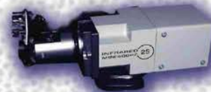
Chamber Surveillance Systems