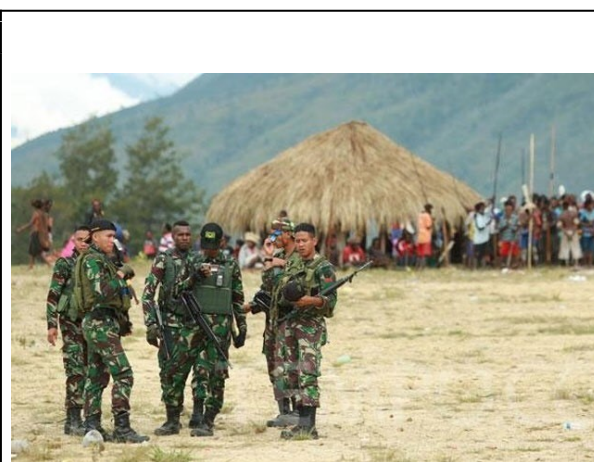
TNI troops in Nduga in January 2019, with a Papuan hut (honai) and local community in the background.