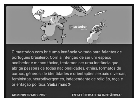
FIGURE 9.2 About page of mastodon.com.br Translation: "Mastodon.com.br is an instance oriented to Brazilian-Portuguese speakers. Aiming to be an inviting and less toxic space, we intend to be an instance that welcomes people from all nationalities, ethnic groups, body formats, genders, diverse sexual identities and orientations, feminists, neurodivergents, independently from religion, race and political orientation."

FIGURE 9.1 About page of masto.donte.com.br Translation: "Masto.donte.com.br is an instance focused on Brazilian users, but users from other places (and languages) are welcome. Hate speech is prohibited. Users who do not respect the rules will be silenced or suspended, depending on the severity of the violation."