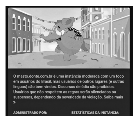
FIGURE 9.1 About page of masto.donte.com.br Translation: "Masto.donte.com.br is an instance focused on Brazilian users, but users from other places (and languages) are welcome. Hate speech is prohibited. Users who do not respect the rules will be silenced or suspended, depending on the severity of the violation."