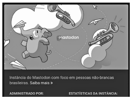
FIGURE 9.5 About page of bantu.social Translation: "Mastodon instance focused on non-white Brazilian people."

FIGURE 9.4 About page of colorid.es Text retrieved from their official English version: "Colorid.es (from colorides, 'colorful people') is an instance focused on the queer/ LGBTQIAPN+ community. Anyone can make an account, but don't be surprised if you encounter few het, cis and perisex people here. We take our rules seriously, so please read that section before making an account. Also, this is an instance primarily for Portuguese speakers. People who don't speak Portuguese or who will also speak in other languages are welcome, though, as long as our moderation team can handle it!"