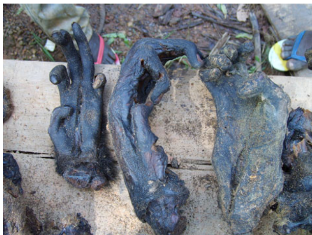
PLATE 1 Hands and feet of chimpanzees Pan troglodytes verus , found in a truck transporting bushmeat to Monrovia from the south-east of Liberia.

two of three taxa targeted for human consumption in all areas where the trade has been documented (Fa & Brown, 2009). As the composition of a hunter's catch depends largely on what is available and is related to the proximity of high forest (Hoyt, 2004), the high proportion of threatened species indicated that hunters were operating in areas that still support a high level of biodiversity. Law enforcement is weak and the risk of being caught is low, and therefore it is reasonable to assume that at least some hunting activity occurred within the Park, although hunting of some species is illegal regardless of the location.