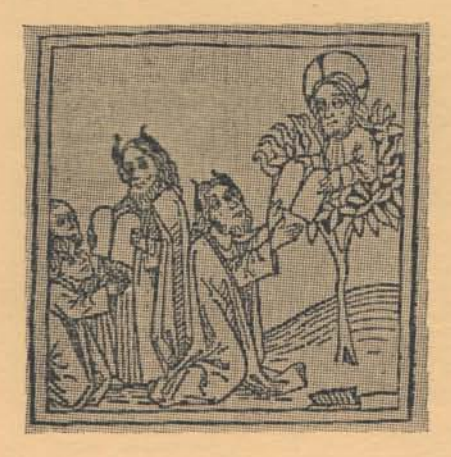
Vol. 2: The West from the Fathers to the Reformation