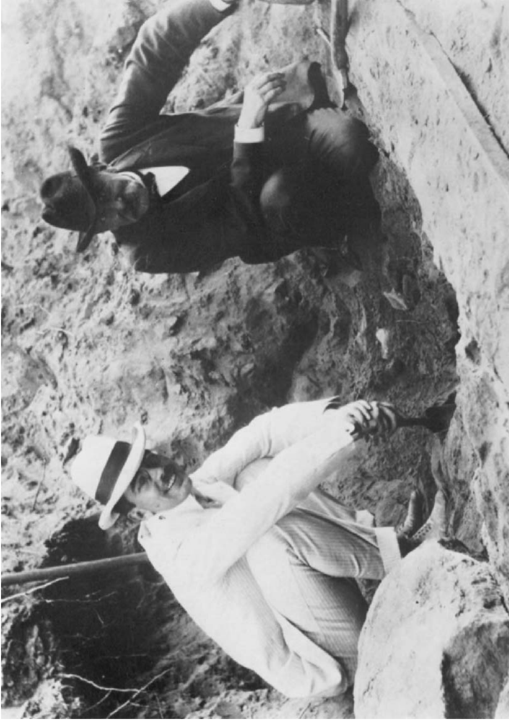
PLATE XII: EDITORIAL

Prince Gustav Adolph of Sweden and Professor Oscar Montelius at the excavation at Kulla-Gunnarstorp, Skåne, in the year 1905