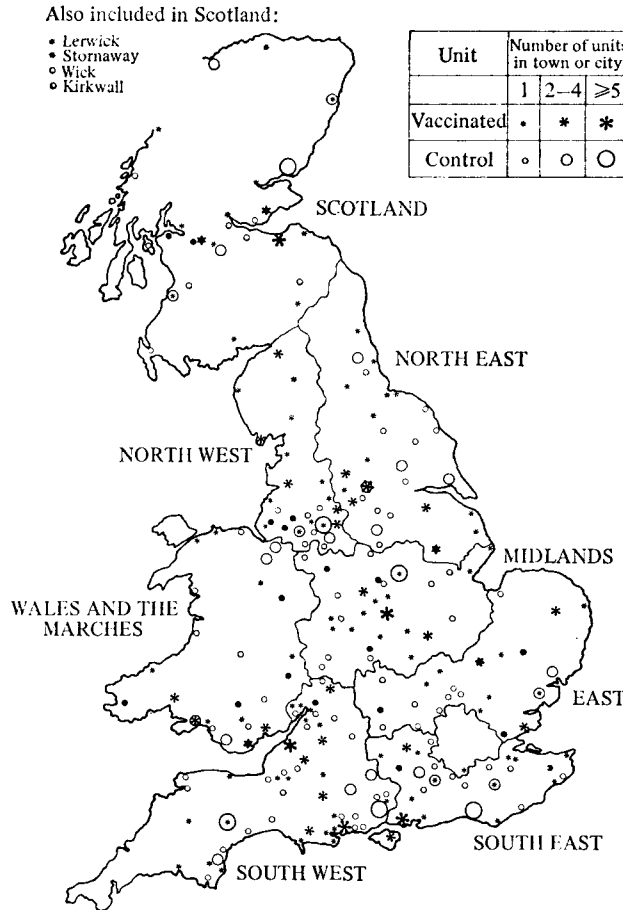
Fig. 1. Location of Post Office Regions and of Units in the Study.

areas throughout Great Britain with the exception of London and Birmingham, which were excluded to ensure a reasonably static population (Fig. 1). The total number of units and employees taking part is shown in Table 1.