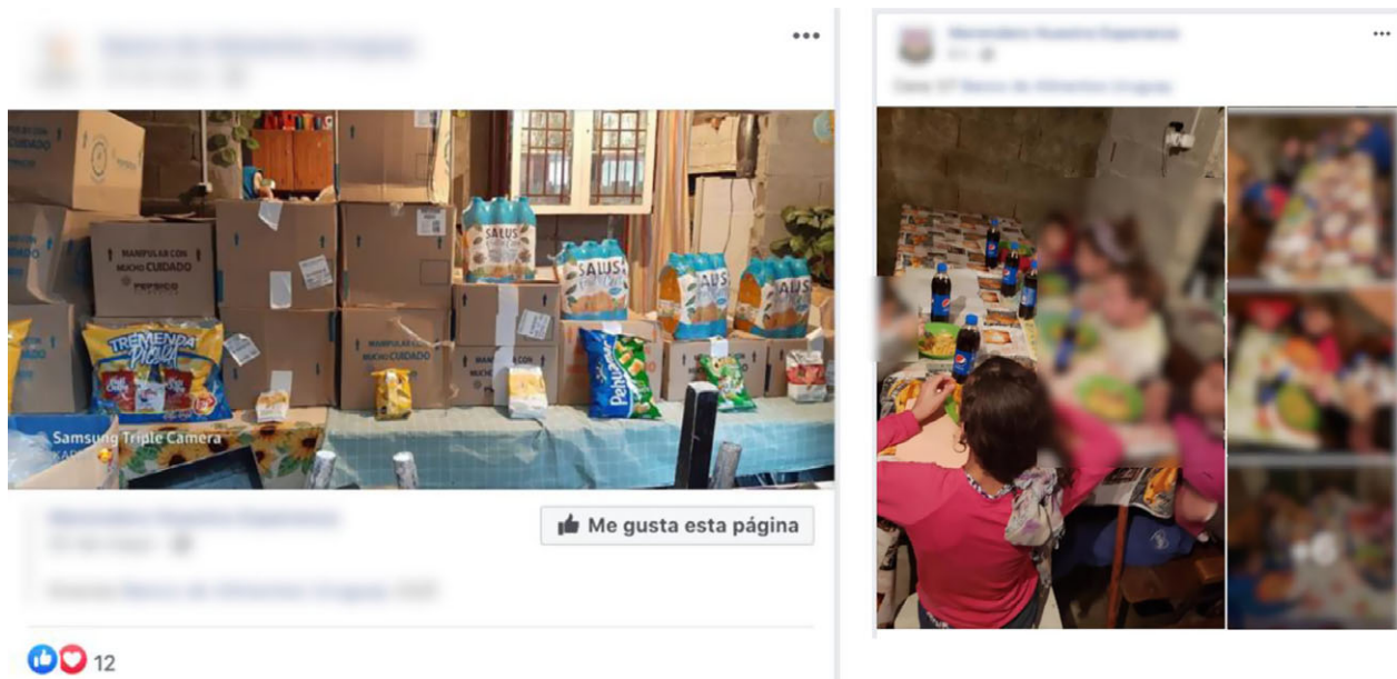
Fig. 3. (colour online) Example of Facebook posts from non-governmental organisations (NGO) showing donations from brands of ultra-processed products

efforts was devoted to create positive associations with the brands. This marketing approach is not harmless; it has been shown to influence consumers' associations and purchase intention of the products commercialised by the brands (13,42) . Therefore, the findings reported in this study reinforce the idea that brand marketing should be a central part of digital marketing regulations. The regulation of brand marketing is expected to be challenging as it requires the definition of which brands are associated with unhealthy products. A first step in this direction is the UK's restriction of brand marketing that intends to promote specific products high in fat, salt or sugar (46,47) . Nevertheless, it should be noted that most of the social media posts promoting brands would not be included in this regulation. Policymakers are encouraged to engage in the challenging task of including brand marketing in social media within the scope of advertising regulations.