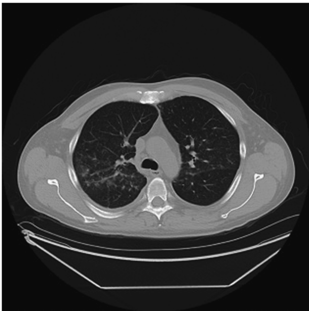
Figure 2: CT of the chest. An area of limited pulmonary hemorrhage is observed in the right middle and upper lung zones.

presentation which may delay the treatment to preserve renal function. 6 Baseline testing of anti-GBM levels is of unclear predictive value as these autoantibodies may exist in asymptomatic carriers. 6 However, a high index of suspicion should be maintained for every alemtuzumab treated MS patient, and creatinine and urinalysis disturbances should be monitored closely with early referral to nephrology and anti-GBM testing. Caution should be exercised when prescribing alemtuzumab to active smokers and patients with a family history of autoimmune disorders who may be at increased risk of secondary autoimmunity.