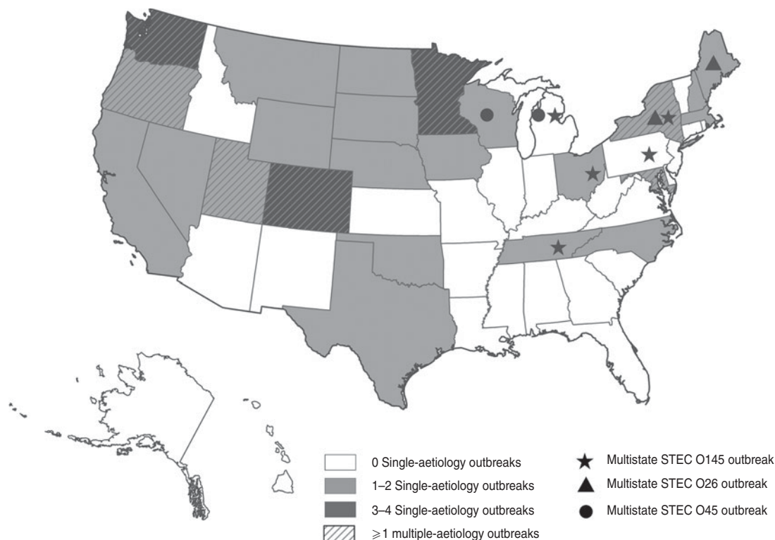
Fig. 1. Outbreaks of non-O157 STEC infection, by state to 2010.

laboratory-confirmed), 144 hospitalizations, and one death in 26 states (Fig. 1). The first outbreak was reported in 1990 and the number reported increased after 1998. Most (59%) occurred during 2007–2010 (Fig. 2).