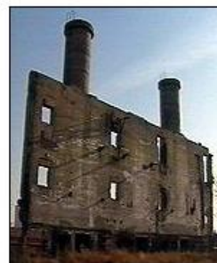
Remains of one of Unit 731's germ factories in Manchuria serve as a reminder of the atrocities that took place during Japan's occupation of China during World War II

During the 1981 burst of publicity, Justice B.V.A Roling, a Dutchman and the only surviving judge from the International Military Tribunal for the Far East in Tokyo, Asia's Nuremberg, complained that no word about biological warfare had been offered in evidence. He wrote: "It is a bitter experience for me to be informed now that centrally ordered Japanese war criminality of the most disgusting kind was kept secret from the court by the U.S. government."