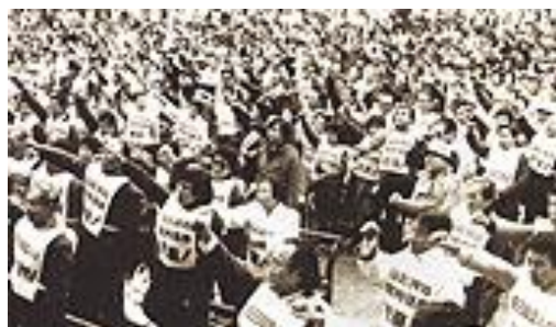
Mindan-organized anti-fingerprinting rally of 15,000 at outdoor Hibiya Hall, Tokyo in 1983

The resistance to fingerprinting was bound up with other means of asserting ethnic existence. As early as the late 1960s there were sporadic initiatives to use ethnic Korean names in Osaka, and individual “comings-out”—to use one’s “real name” [ honmyo ] instead of Japanese name [ tsumei —occurred throughout the 1970s. As a 1970s pamphlet stated, “the use of tsumei itself is clearly a form of ethnic discrimination.” Arguing against the practical benefits of passing, activists sought not only to promote ethnic pride but also to extirpate discrimination. The “real name” initiative marked the limits of passing in the