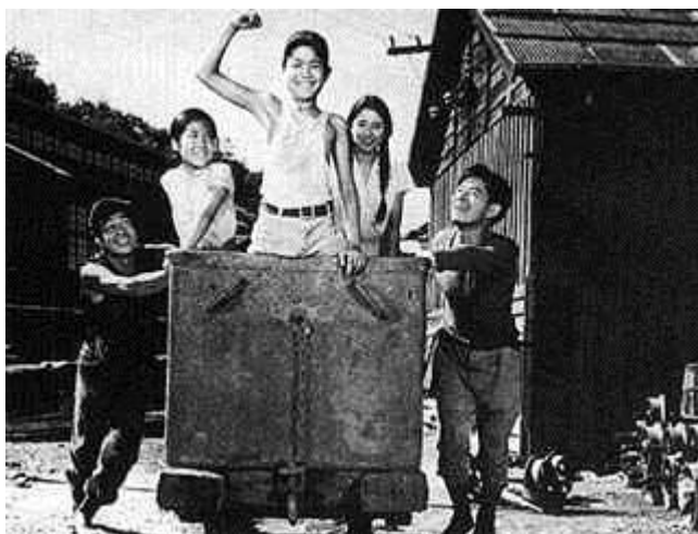
From the film of Nianchan

“pure”. Yet it is nonetheless surprising to find a systematic effacement of the best-selling postwar book by a Zainichi author.