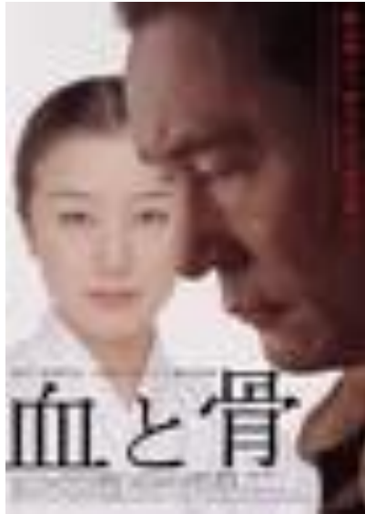
Chi to Hone: Rethinking the patriarchal undercurrent of first-generation Zainichi