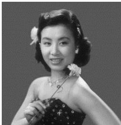
Legendary enka singer, Misora Hibari