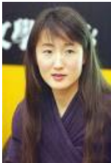
Yu Miri: a best-selling author and a figure of controversy