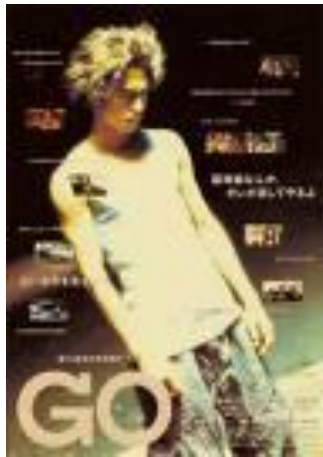
Go: Kaneshiro Kazuki's best-selling novel was made into an award-winning film, providing a fresh image of Zainichi

In Kaneshiro Kazuki's Go (2000), the protagonist, Sugihara, opens the novel with a description of his communist, North Korean father, the Japanese colonization of Korea, and the family's desire to visit Hawaii—a vacation that requires switching their nationality from North Korean to South Korean (and shifting their membership from North Korea-affiliated Soren to South Korea-affiliated Mindan). The stuff of the novel's first five pages has been recounted countless times by Japanese and Zainichi writers, but no one would have imagined that it would make a best-selling novel. Reciting Bruce Springsteen's "Born in the U.S.A."—though observing that Springsteen grew up in a poor family whereas his family is well-off—Sugihara sings his own refrain of "Born in Japan." At once erudite and violent, he is highly individualistic and antiauthoritarian; he is the proverbial nail that should have been hammered in. In the 1960s and 1970s, Zainichi was all seriousness and suffering: as the pejorative slang would have put it, "dark" [ kurai ]. The unbearable burden of Zainichi being traumatized, Zainichi life-course and discourse. Instead, Kaneshiro's prose and protagonist exemplify a striking mode of being cool [ kakkoi ] in contemporary Japanese culture.