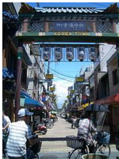
Koreatown in Osaka