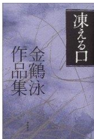
Ijuin: Some best-selling authors are self-identified Zainichi, but somehow fail to be included in the canon of Zainichi literature

and Lee Hoesung over that of Kin Kakuei. Not surprisingly, the champion of Kin's work has been Takeda Seiji, a self-conscious rebel against Zainichi ideology. Yet those who remained faithful to Soren, such as Yi Unjik (1967–68) and his epic trilogy on the politics of Korean liberation, are also neglected. Narrow is the gate to Zainichi-ness.