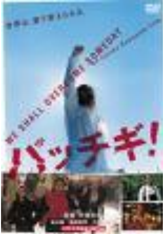
Pacchigi: recapturing in film the brighter moments of the Zainichi decades of disrecognition

The inevitable instability and complexity of identity paradoxically generate expressions of ethnic fundamentalism: the notion that one's ethnic background should disclose profound and meaningful truths about oneself. It would be bizarre to believe that one's peoplehood background was irrelevant; the country, the people, and the life produced the self for which any expression cannot possibly expunge them. The condition of disrecognition tempts the disrecognized to reverse the imputed, indubitably pejorative attributes and to crystallize them as the memory of the struggle itself and the essentialist template of recognition. What remains in the first instance is the recollected and rehearsed history of disrecognition and the struggle for emancipation. Furthermore, just as Japanese disrecognition of Koreans portrayed them in the general, the Korean recognition of themselves capture themselves in the general, though the substantive judgments are antipodal. Thus, some Zainichi would articulate a short litany of essential Zainichi-ness, such as the history of enforced migration and the