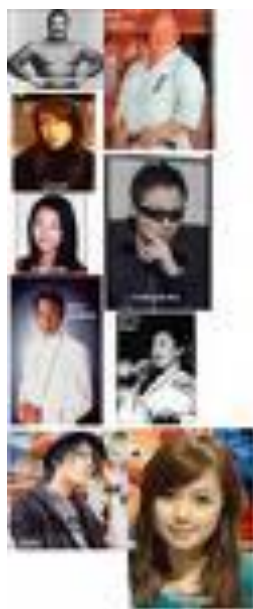
Zainichi diversity among the famous and the popular

Hwang, Kyo, and Yu are Zainichi, but they reveal little commonality. Surely, we can seek their differences in part in their divergent backgrounds: gender, region, class, and so on. These social differences exist alongside different courses and contours of their lives. But this is precisely the point. Beyond the sheer diversity of Zainichi professions and personalities, genders and generations, likes and dislikes, we should not forget that an individual is neither unitary and homogeneous nor stationary and unchanging. Virginia Woolf observes in Orlando that “a biography is considered complete if it merely accounts for six or seven selves, whereas a person may well have as many as a thousand.” Although “the conscious self . . . wishes to be nothing but one self . . . ‘the true self,’” it cannot squelch distinct moments and conflicting recollections, ambiguities and multiplicities. Kyo would expend considerable time studying and living in South Korea, and thereafter exploring the distinct trajectories of the Korean diaspora across Asia. Yu would also learn Korean and go on to write novels and stories with strong Korean and Zainichi themes and characters. In other words, temporal