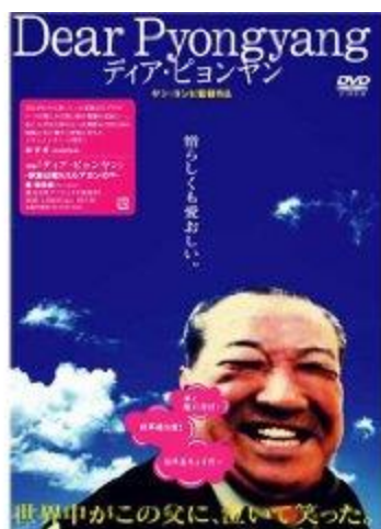
Dear Pyongyang: an award-winning documentary that is part of a reconsideration of Zainichi affinity toward North Korea

In promoting diasporic nationalism, Zainichi ideology erects a prison-house of Zainichi-ness, a collective confinement to ethnic essentialism. Beyond establishing the fundamental pillars of Zainichi identity, it also projects an idealized Zainichi self that mirrors Zainichi historiography: the dialectics of oppression and resistance, poverty and struggle. It also prescribes, like Soren ideology, cultural nationalism, such as learning Korean language, history, and culture, and retains instinctive suspicion of Japan and discourages assimilation.