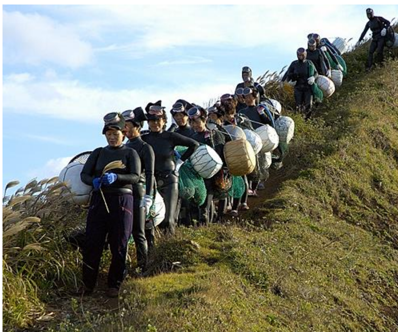
Contemporary Jeju women divers

Although Jeju Islanders' early efforts at resisting Japanese incursions into their fishing areas failed and they moved on to adapting to the new political situation, more bursts of resistance against Japanese rule followed in the 1930s (Yang 1996). Jeju's women divers played a key role in some of these movements (Fujinaga 1989). By then they had fishing rights to the whole Korean peninsula and were used to organizing themselves economically, so although they had no formal schooling, it was a small step for them to form groups to actively agitate for change in areas where their rights were abused.