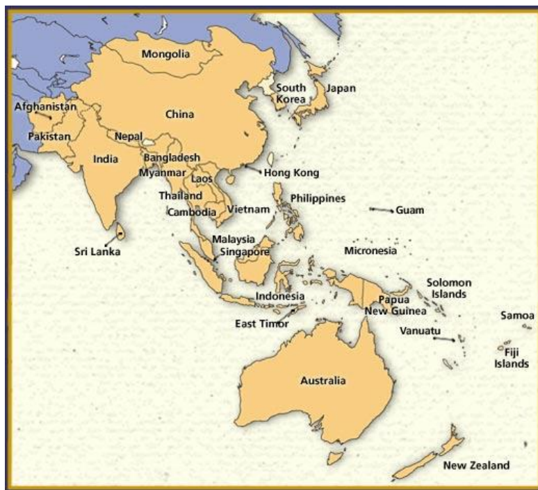
Map of the Western Pacific

Despite centuries of subjugation by larger neighbours—Joseon Korea, Imperial Japan, and South Korea—Jeju island society has maintained a distinct identity and a measure of autonomy. Relations with both Korea and Japan have at times had devastating effects on the islanders, but also contributed to the dynamism of Jeju island society and opened up new routes for islanders to continue traveling as a vital part of their social life.