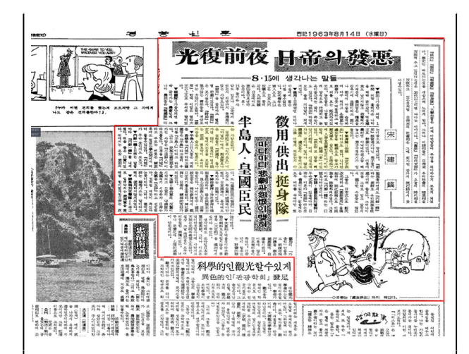
Photo 1: Article (blocked off in red) written by wellknown intellectual Song Kon-ho in the August 14, 1963 issue of the Kyunghyang Shinmun ), under the title, "An evil born on the eve of Korea's liberation from imperial Japan." The image illustrates the forced mobilization of "comfort women."

Teishintai-also referred to as "delivering up the virgins." Women of marriageable age were mobilized and sent to the battlefront and made into "comfort women." They were all sacrifices for the imperial Japanese soldiers. . .. Nobody knows how many young women were transported to the war front or what happened to them.