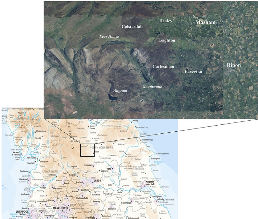
Figure 1. Map showing the Ure Valley, North Yorkshire, and the position of proposed Leeds waterworks (in roman) in relation to Bradford waterworks (in italics).

great deal more beautiful by the existence of these reservoirs'. 18 The notion of reservoirs, as feats of urban engineering, improving the countryside was well established by the early twentieth century both in Britain and abroad – beautifying the landscape and further taming nature was often an important justification for waterworks projects. 19