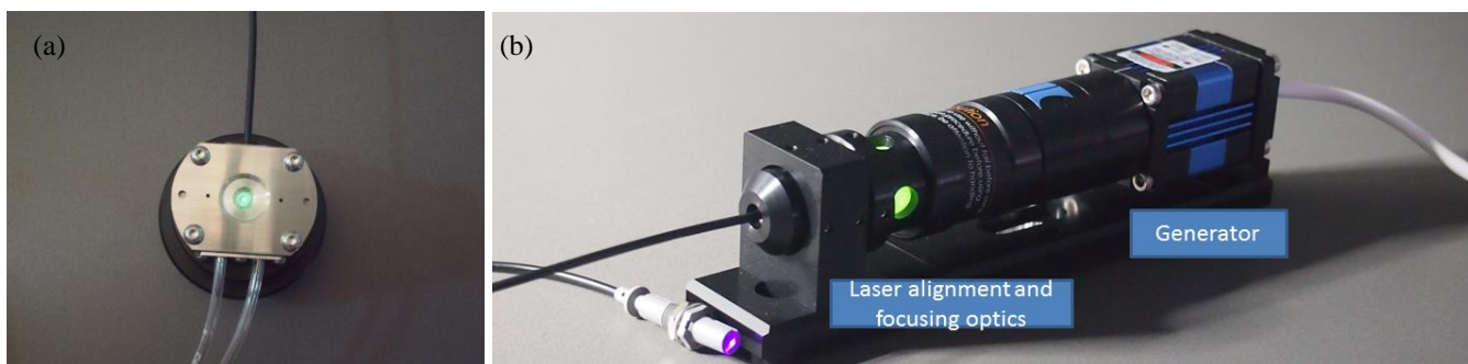
Figure 2. (a) Environmental liquid cell system with optical fiber and gas-liquid lines: Green light is introduced to the fiber optics to show where the thin MEMS membrane window exists.

(b) Laser illumination system: generator is integrated with focusing - alignment optics (unit with yellow window).