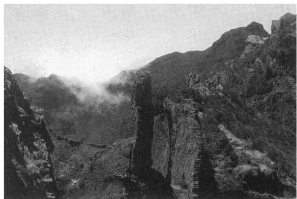
Plate 2 The Central Mountain Massif (Francis Zino).