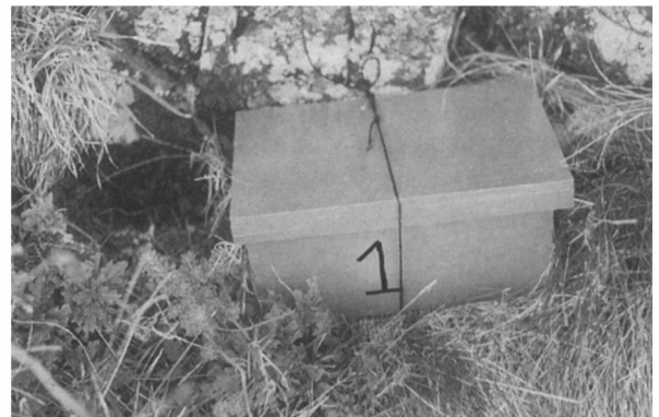
Plate 3 Rat bait box in position on a ledge.

In order to monitor rodent activity and improve the control programme, the 65 boxes in the cordon have been checked weekly since February 1989. At each visit, the percentage of bait removed by rat or mouse was estimated within one of five classes, and chewed or damaged blocks were replaced. These data have been used to prepare an index of bait uptake for the years 1989–97. Preliminary analyses have been made to investigate bait uptake in relation to seasonal variations in temperature and rainfall. The uptake at individual boxes has been used to study the effectiveness of box position in relation to surrounding vegetation height, type and percentage cover, as well as altitude, general aspect and distance from the nearest neighbouring bait box.