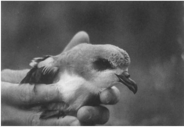
Plate 1 Zino's petrel Pterodroma madeira showing its distinctive black eye mark (Francis Zino).

P. m. deserta should be treated as a distinct species, but had difficulty in accepting that P. m. madeira , should also be considered as such (Bourne, 1957). In 1975, P.A. Zino considered the bird a distinct species (letter to W.B. King). Bourne (1983) formally proposed the separation of the subspecies into the following species: P. madeira , endemic to Madeira, P. feae , restricted to Bugio and the Cape Verde Islands; and P. mollis , of the Southern Ocean. Imber (1985) and Warham (1990) later confirmed this status. Recent DNA studies on blood samples from Zino's petrel and Fea's petrel confirm that they are distinct species (Nunn & Zino).