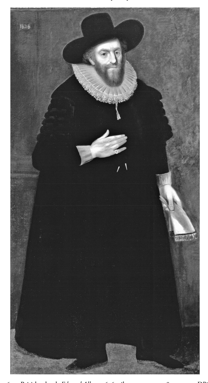
Figure 6.1 British school, Edward Alleyn , 1626, oil on canvas, 203.8 \times 114 cm, DPG443, Dulwich Picture Gallery, London