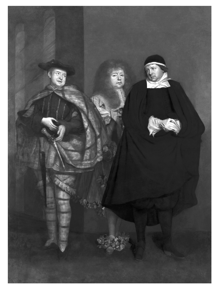
Figure 6.2 John Michael Wright, John Lacy , c. 1668–70, oil on canvas, 233.4 × 173.4 cm, Royal Collection Trust / © His Majesty King Charles III 2023