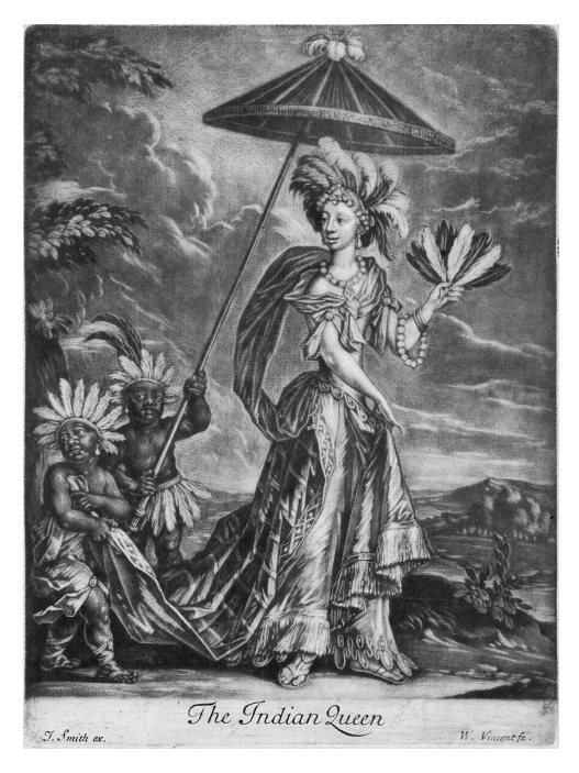
Figure 6.4 William Vincent, The Indian Queen, c. 1685–95, mezzotint, 19.5 × 14.5 cm

performers.<sup>157</sup> Celebrity such as Harris's depended upon the skillful juxtaposition of accessibility and unavailability: he invites Pepys backstage, but he does not deign to make conversation. In that respect, the celebrity is a perpetual tease, exhibiting the frank gaze, flashing the come-hither smile, and sharing the fleeting emotional connection that seduces us into thinking we know a glamorous stranger otherwise off-limits to our pedestrian existence. Star performers excel at creating desire for what is ultimately withheld. Undoubtedly, popular actors on the Shakespearean stage, such as Burbage and Alleyn, also possessed "It," that indefinable quality for which people pay handsomely. They were not, however, celebrities in the manner of a Betterton or Barry. While it is tempting to point to biographies and pictorial images as incubators for this new social phenomenon, these did not originate fame but rather perpetuated it. "Cheap print," to use Tessa Watts's phrase, was very much a feature of Elizabethan life, and the broadsides and ballads that celebrated the lives of merchants and