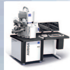
CrossBeam® FIB-SEM AURIGA® NVision 40