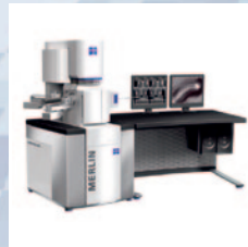
FE-SEM MERLIN® SUPRA® Series ULTRA Series SIGMA™ Series