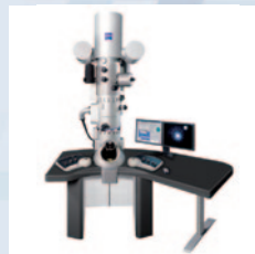
TEM LIBRA® 200 Series LIBRA® 120