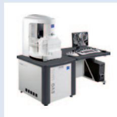
SEM EVO® MA and LS Series