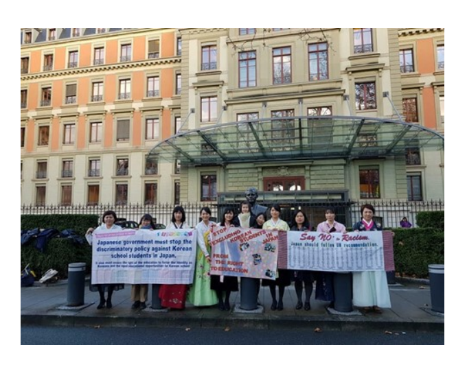
Figure 2: The members of omonikai visited the UN in Geneva to lobby at the 2019 CRC meeting in January 2019.

In order to protest against the successive cancelations of local government subsidies and to support the Chosen schools in their court cases against the government, a group of omonikai members visited the UN in Geneva in 2013, where the Committee on Economic, Social and Cultural Rights (CESCR) was holding its third periodic session on Japan.98 Along with other civil social organizations, such as the Japan Federation of Bar Association and Korean International Networks-MongDang Pencil, a South Korea-based civil rights organization that supports ethnic education in Chosen schools, the omonikai members informed the CESCR's committee of the violations of the human rights of children in Chosen schools. In its concluding observations, the 2013 CESCR indicated that the Japanese government had violated the Right to Education in Articles 13 and 14 of its treaty, again urging the government to extend the Tuition Waiver Program to Chosen high schools.99 Moreover, the 2014 CERD recommendation to the Japanese government pointed out that the government needed to "revise its position and allow Chosen schools to