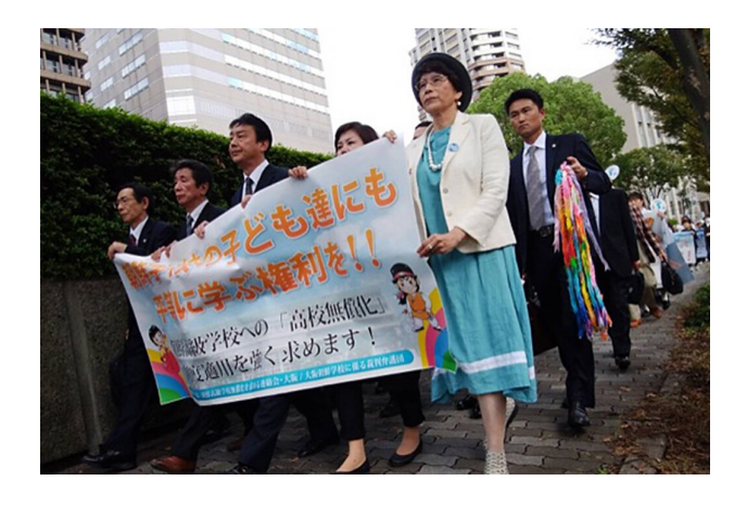
Figure 3: The plaintiff and supporters of Chōsen schools in the Osaka case marching to enter the Osaka High Court on September 27, 2018.

guarantee equality and the right of zainichi Koreans to develop their identity by learning their language, as well as by learning about their culture and history.