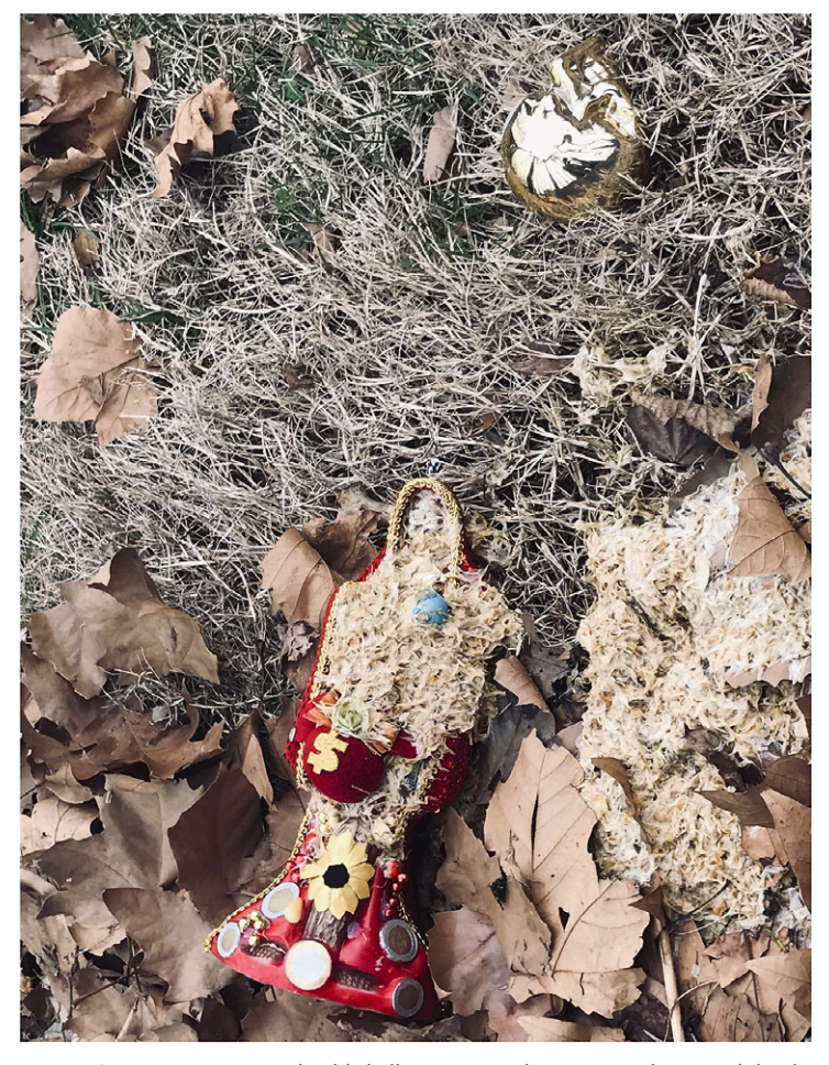
Figure 11. Decaying Santa Muerte and gold skull, Green-Wood Cemetery.

The paradox of still life is using a static moment to unfurl the longer durational timeline of decay and mortality. The decay-life of things is a paradox of living after death. Decay is active; the fungi, water, insects, rats, and groundskeepers act as a network of actors facilitating, arresting, and ending decay. The tributes, as a point of contact between the hemispheric pairing of the living and the dead decay for us visibly in the cemetery. They entangle the dead and the living in the processes of decaying as part of a wet entropy of rot. Bodies and leaves rot in the park, the cut flowers turn to brown sludge attracting mosquitos, and the grass grows back covering the overturned dirt of new burials. The decaying Santa Muerte statue (Figure 11) rotted in the corner of the cemetery; next to it, a gold skull like a shinning bauble remained whole and eventually was picked up and placed upright on the cement ledge supporting the fence posts until it too vanished. Taken, thrown out, tarnished, tattered—somewhere the dead were left a tribute that ended up thrown against the fencing that kept it contained within the deathscape of the cemetery.