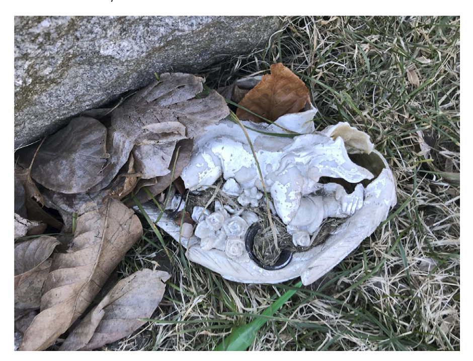
Figure 8. Broken statue. Green-Wood Cemetery, February 16 2021.

the trash remnants hold in the experience of space. A techno-utopian fantasy of preservation is an arresting of decay. The ecology of decay and its facilitation of entropic materiality becomes a politics of the Anthropocene where the permeability of things is imperative to combat stockpiling of capital that threatens to overwhelm us in museums and trash heaps. <sup>28</sup> The TRES art collective (Ilana Boltvinik and Rodrigo Viñas) work with trash materials in their art practice and attend to the pervasiveness of waste in local and global contexts. In these spaces, however, they are interested in "the intimate relationships we have with waste" where the closeness in which "we live with waste becomes an aesthetic experience that reveals new information and symbolic values about trash and our society." TRES works with trash as a local and global category, one that moves between hyper-embedded local experiences and a global crisis.