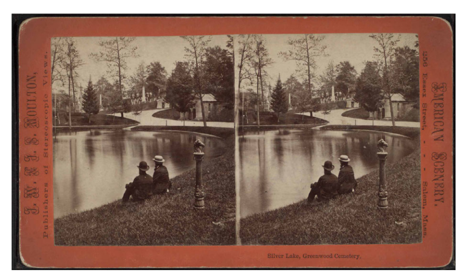
Figure 1. The Miriam and Ira D. Wallach Division of Art, Prints and Photographs: Photography Collection, The New York Public Library. "Silver Lake, Greenwood Cemetery." New York Public Library Digital Collections. Accessed October 18, 2023. https://digitalcollections.nypl.org/items/510d47e1-e682-a3d9-e040-e00a18064a99

New York Times article, from thirty years after the cemetery's founding, presents it as an idyllic rural space and one in sharp contrast to the inherited conceptualizations of what burial sites were; the author writes, "Green-Wood does not realize the old-fashioned grim memoires of the church-yard where ghosts and goblins were wont to hold high revel. People in their first paroxysm of grief would prefer to wander through groves of weeping willows, but not too many. The Comptroller ... very properly remarks, 'however pleasant the shade, the sunshine is better. There is nothing so neat and clean—nothing that is so pleasing at all seasons and to all eyes, as close shaven green sward." 5