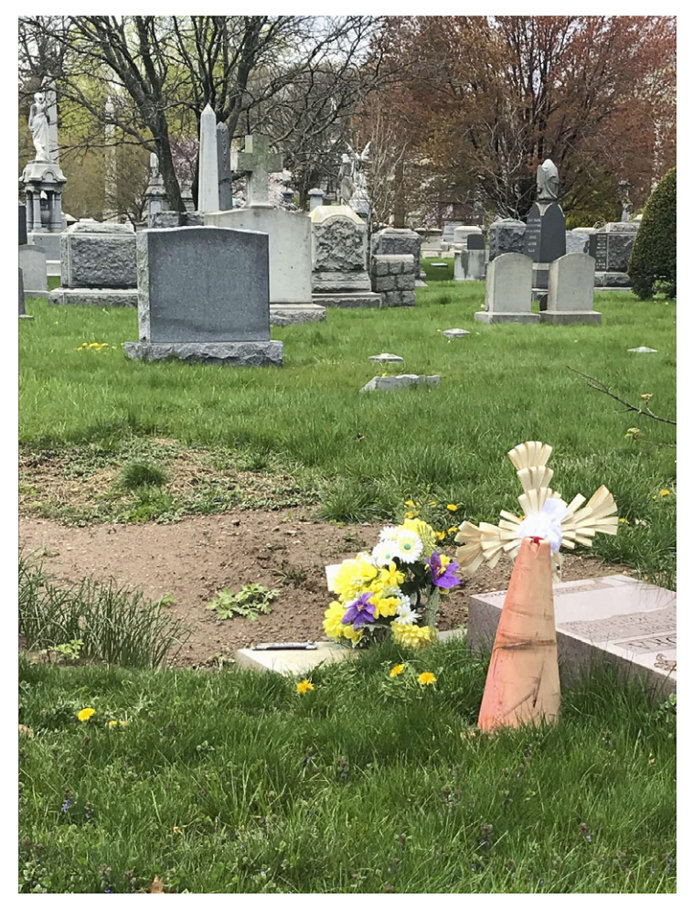
Figure 12. A grave without grass yet covering it with Palm Sunday cross Green-Wood Cemetery, April 23, 2021.

A riot of rot spreads across the cemetery. It morphs the landscape; Green-Wood—as a heritage site that moves between natural and artificial heritage, betwixt historical and contemporary frames, and in a liminal relational space of the living and the dead—is a fully living collection where each part co-configured the whole. It is, in effect, an entropic living site. Decay becomes substratum of life—decay rejects stasis and intact authenticity. Just as everything is living in Green-Wood, everything is also decaying; even the dead continue to decay. Death is not an end, as it were. In their FAQs one of the listed questions asks, "Why is there no grass at my loved one's grave?" (Figure 12). This is because it takes over a year for the grass to grow after the ground has been opened and the ground sinks causing headstones to move and plants not to take root. As a result, over those months of settling, the