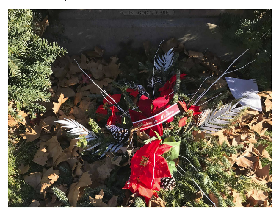
Figure 4. "Christmas in Heaven" bouquet on a grave, January 10, 2021 at Green-Wood Cemetery.

Green-Wood, eggplants were resting and slowing rotting on the leaves by the fence at the edge of the cemetery (Figure 5). The eggplants place us in the larger neighborhood context that Green-Wood cemetery now is located in; no longer a rural cemetery, it has been a fixed point within a changing Brooklyn. Today, the cemetery is located a few blocks from Flatbush which, in 2018, was named "Little Haiti" a year after Flatbush also received the cultural district designation "Little Caribbean." Eggplants are common cemetery offerings within Afro-Caribbean traditions and are specifically connected to Orisha Oya who is connected to cemetery gates and the color purple, as Saille Caia Murray notes in her analysis of food offerings in the Sugar Hill area of Harlem. Consumption in the cemetery engages in symbolic, spiritual, and accidental relationships mediated by the actors in the cemetery—the dead and the living human and non-human animals. At a graveside in early January, I watched as a young man drank half a bottle of Dewar's White Label before he capped the bottle and propped it up on the tombstone before leaving (Figure 6).