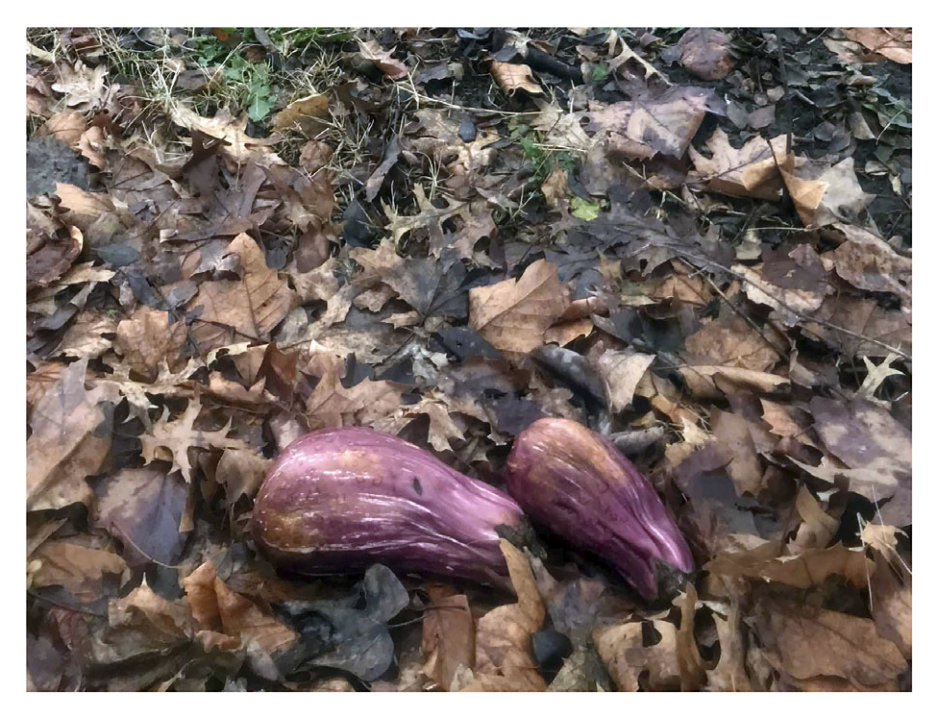
Figure 5. Eggplants at the Cemetery fence, March 1, 2021.