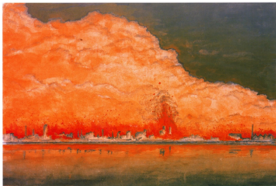
The Mukojima Area in Flames

spreading throughout Honjo and Fukugawa wards. It is hard to explain why we headed towards the fires, but it seems that people lose the capacity to make cool judgments in such situations. The area to the north of our home was already engulfed in flames and sparks were raining down over our heads, so we felt we had to run in the opposite direction. The road was overflowing with people escaping with their various belongings, all of them heading south. We would have needed great conviction to go toward the wind in the opposite direction from that advancing wave of people. There were raging fires in the Asakusa district to the north and we could see fires burning in every direction. The only place that still seemed relatively dark was the Azuma-cho area in the southeast. My father held the handles at the front of the cart, my mother and I pushed it from behind, and my two sisters ran at the sides as we made for that dark place.