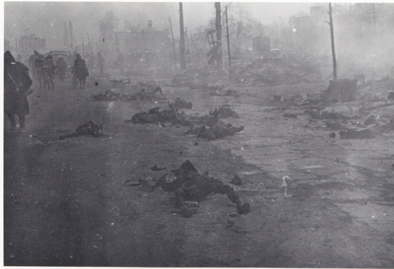
Bodies of firebombing victims in Hanakawado, Asakusa ward