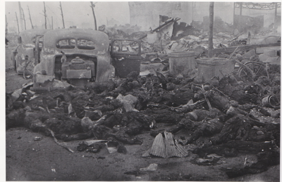
Bodies in Ishihara-cho, Honjo ward

photographs of the charred bodies on the roads, bodies of women and children, and bodies piled up in heaps. As I pointed my mud-covered Leica at the corpses of all those people who had died in deep resentment, I imagined I heard an invisible voice rebuking me from above. My hands trembled and I could only press the shutter button weakly. But as long as I was alive, I had to keep taking those photographs to fulfill my mission, and to do that I had to be hard-hearted. When I had finished my work, I put my hands together in prayer for the victims and went on my way."