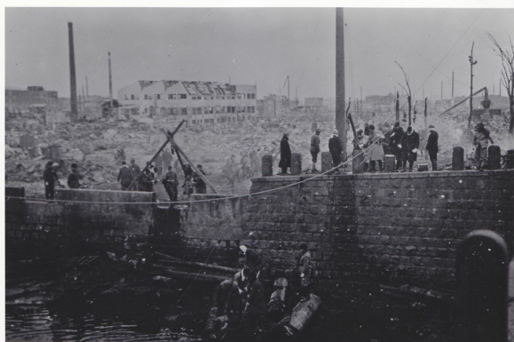
Bodies being pulled out of the canal near Kikukawa Bridge

to the bridge. From the river I heard men's voices shouting "One, two, three, heave!" When I got to the quay of the Sumida River, I could only stare in horror. On the stone wall of the smoldering quay were several civil defense corpsmen in khaki uniforms with cloths wrapped over their heads and tied under their chins. From a gap where the wall had collapsed they made their way backward and forward over the logs on the water's surface. Shouting instructions to each other, they were pulling dead bodies out of the water. Looking down, I saw that the river was full of burned and drowned corpses. The men were reeling in the bodies with hooked poles. They bound the stiff corpses with ropes, hauled them up onto the quay, and laid them down in rows like tuna at a fish market. Then I noticed that my father was standing behind me. 'Take a good look, Katsumoto,' he said. "Look and never forget. This is what war is." I clearly remember the way he spoke, muttering the words under his breath. Exhausted by his struggles and privations, he died shortly after the war ended. The frightful scene we witnessed in the Sumida River and my father's despairing voice have always stayed with me.