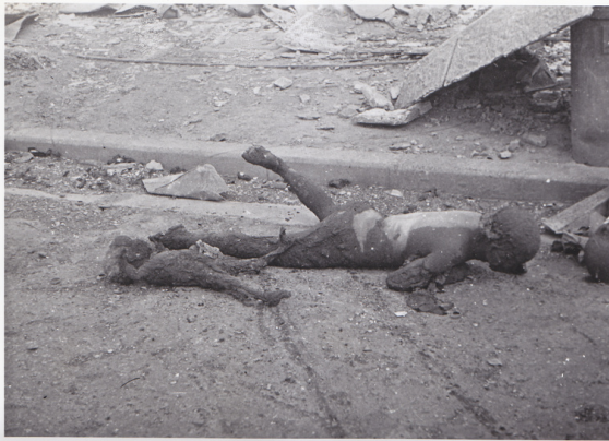
Bodies of mother and child