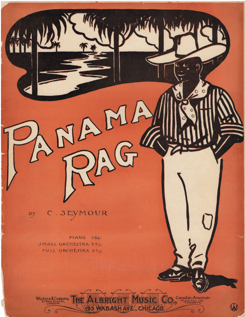
Figure 4 Cover illustration of 'Panama Rag' (1904) by Cy Seymour.

increasingly fashionable from the mid-nineteenth century onwards, with a white person. The Panama hat, of Ecuadorian origin, got its name because of the lively trade in Panama and the customs stamp associated with it. Furthermore, it is linked to the construction of the Canal in a range of different ways. The workers, most of them Black women and men from the