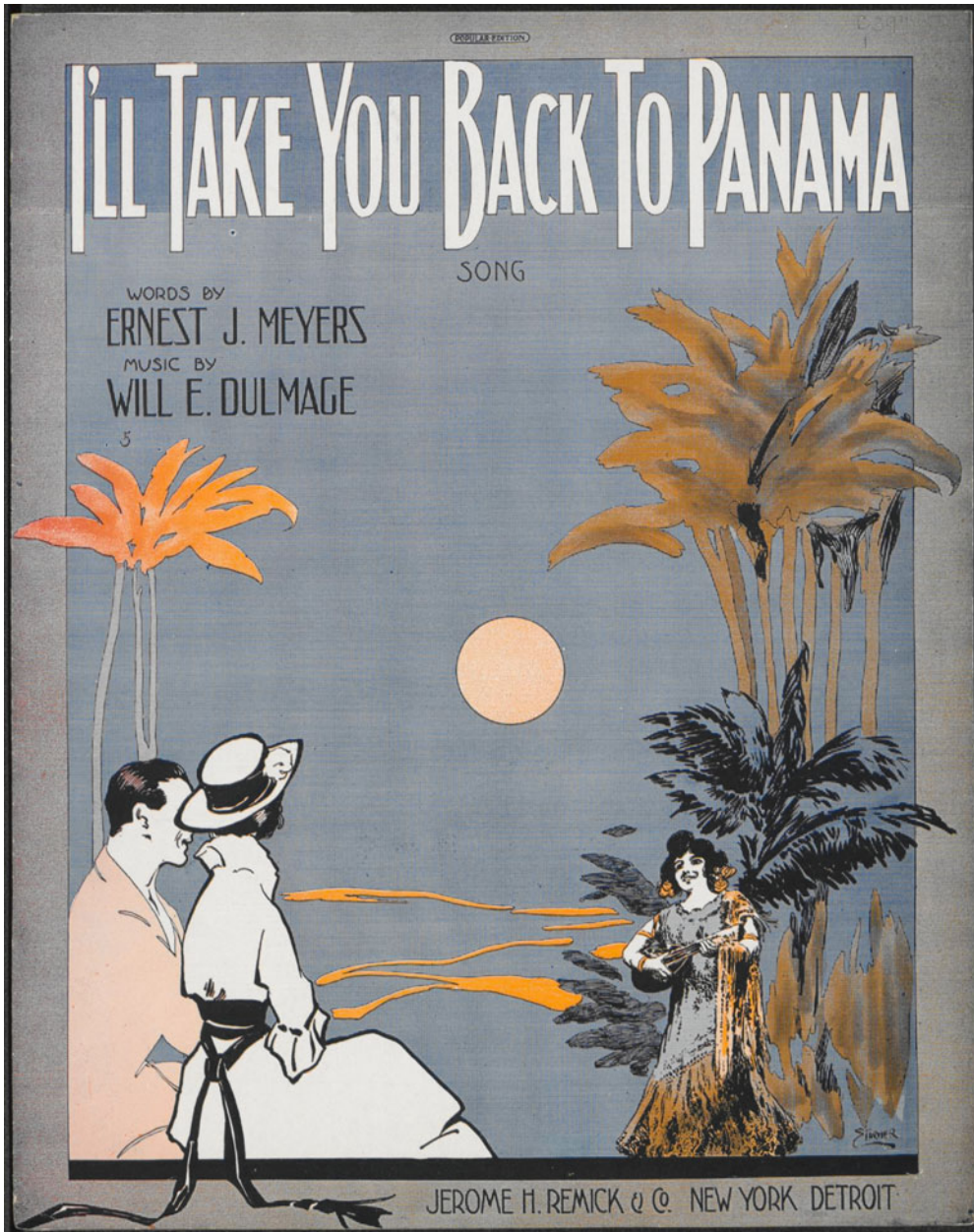
Figure 2 Cover illustration of 'I'll Take You Back to Panama' by Ernest J. Myers and Will E. Dulmage.

neocolonial discourse, namely 'to construe the colonized as a population of degenerate types on the basis of racial origin, in order to justify conquest and to establish systems of administration and instruction'. 40