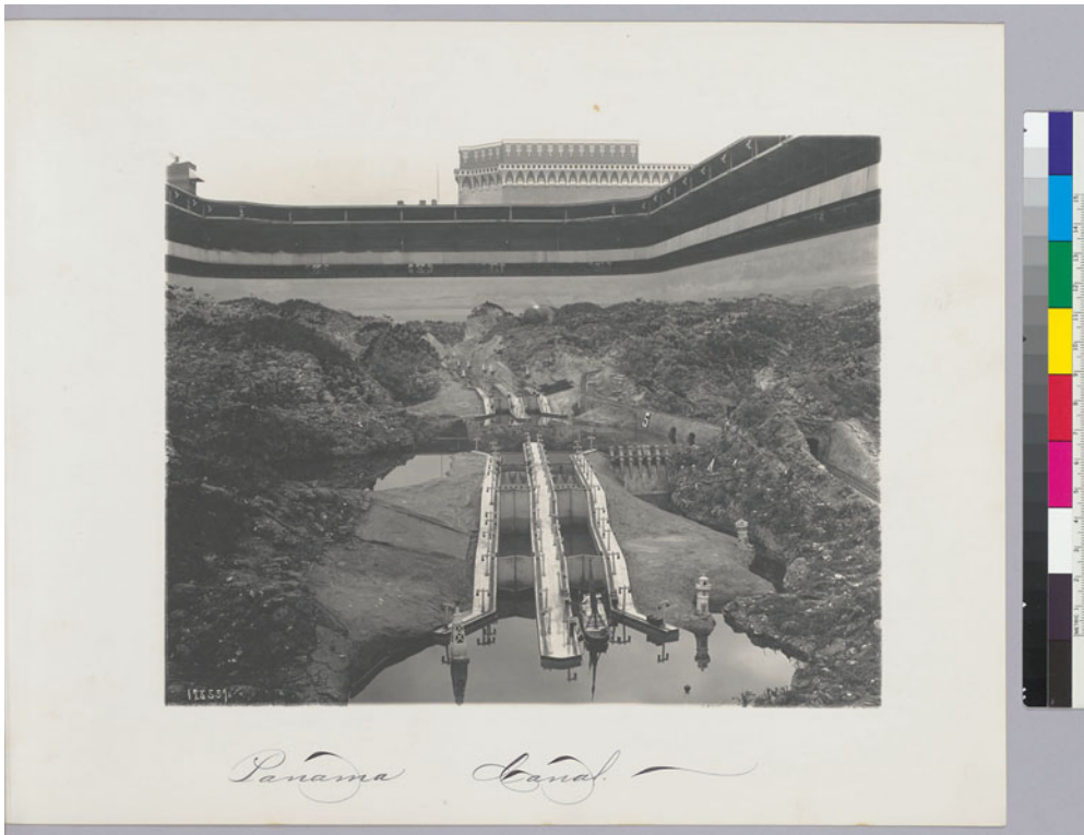
Figure 1 Model of the Panama Canal at the 1915 Panama–Pacific International Exposition in San Francisco.