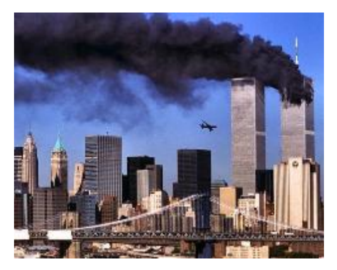
World Trade Center under attack on 9-11

What came to be known as "defense transformation" first began to be publicly bandied about during the 2000 presidential election campaign. Then 9/11 and the wars in Afghanistan and Iraq intervened. In August 2002, when the whole neocon program began to be put into action, it centered above all on a quick, easy war to incorporate Iraq into the empire. By this time, civilian leaders in the Pentagon had become dangerously overconfident because of what they perceived as America's military brilliance and invincibility as demonstrated in its 2001 campaign against the Taliban and al-Qaeda -- a strategy that involved reigniting the Afghan civil war through huge payoffs to Afghanistan's Northern Alliance warlords and the massive use of American airpower to support their advance on Kabul.