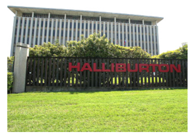
Halliburton Corporation's Houston offices

& Root), a subsidiary of the Halliburton Corporation of Houston.