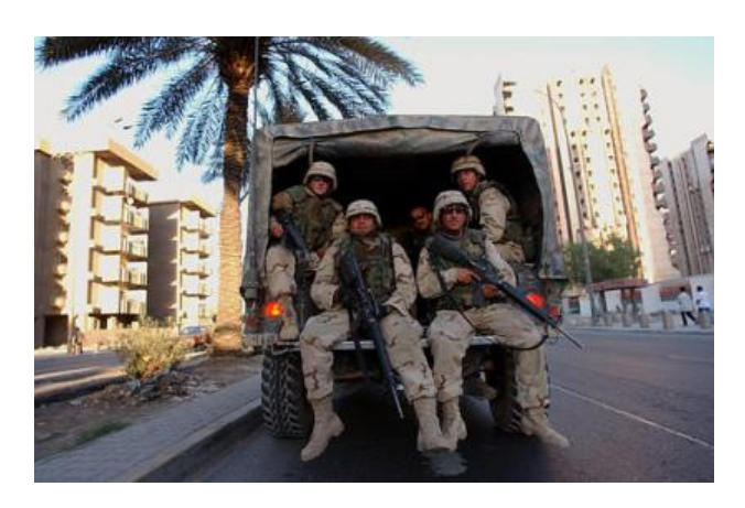
U.S. troop in Iraq

The total of America's military bases in other people's countries in 2005, according to official sources, was 737. Reflecting massive deployments to Iraq and the pursuit of President Bush's strategy of preemptive war, the trend line for numbers of overseas bases continues to go up.