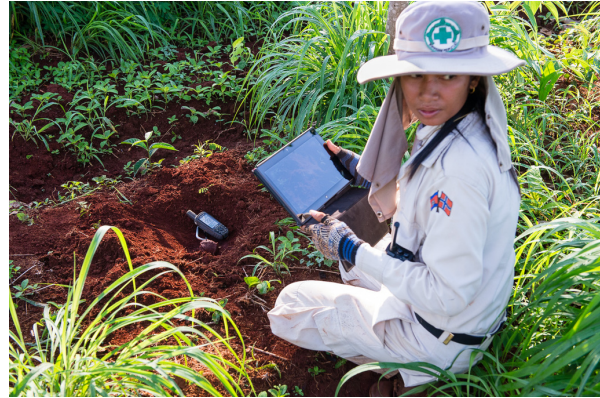
Ratanakiri Province, Cambodia, 2014 - The leader of an NPA technical survey team uses her tablet computer to record a bomblet her team has found with the precise location derived from her GPS tracker.

The results of a nontechnical survey are analyzed using GPS maps and computer modeling; areas which show no sign of contamination can be released for public or private use, while evidence of suspected hazardous areas will lead to a technical survey. Using GPS and computerized maps, NPA sends out trained deminers with metal detectors. They will sweep 25 square meter boxes to locate any metal, then carefully excavate the ground to see what is there. Generally the signal comes from harmless metal fragments, but sometimes it comes from a bomb, a mortar round, an artillery shell, or land mine. In many locations, NPA has shifted to using highly trained detection dogs which can search much faster than human deminers, with near-perfect accuracy. NPA is now using small commercially available drones as well.