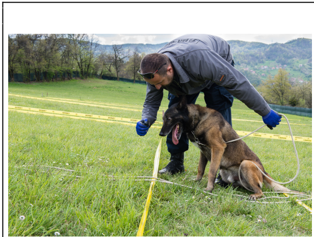
Vogosca, Bosnia and Herzegovina, 2014 - a trainer puts one of the Belgian Shepherd Malinois through its paces in a field at NPA's Global Training Center, just outside Sarajevo.

over the target. The dogs work far faster than humans with a metal detector, and with much greater accuracy. Although the dogs are used all over the world, they are trained to understand and obey commands in the Norwegian language. Currently NPA operates dogs in six countries, including Cambodia. NPA started training its own dogs at the GTC in 1999 and has never had a dog-related accident. (NPA also trains dogs for the Norwegian and Bosnian armies.)