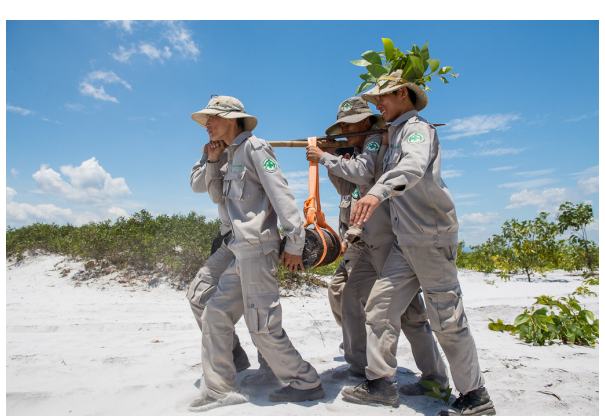
Thua Thien Hue Province, Vietnam, 2014 - Members of an EOD team carry away a large artillery shell discovered in a remote area in the province. It will be detonated later at a site used for safe disposal of ordnance.

NPA is one of the major organizations in the world clearing mines and UXOs, but it is different from many other demining groups. Private corporations, staffed by military veterans, are often hired by countries or big property owners to parachute in, clean up a town or plantation and move on to the next job. Some NGOs bring in experts who complete the work but then depart, leaving the local community unprepared to tackle the ongoing problem themselves. Military veterans from the U.S. and other western countries who have EOD (Explosive Ordnance Disposal) experience generally prefer to work for those organizations because they pay so much better than NPA.