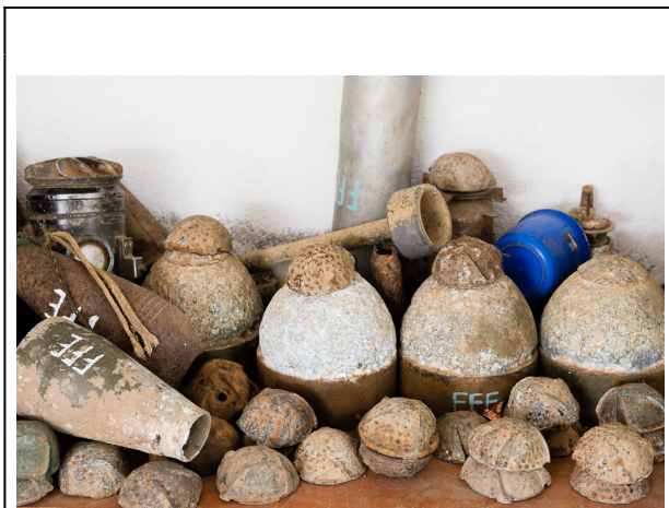
Sekong, Lao PDR, 2014 - Behind its regional headquarters in Sekong, NPA keeps a number of cluster bomb units (also known as "bombis") discovered and rendered safe by deminers.

Over the last five years, I've been travelling to different countries to photograph the work of two non-governmental organizations (NGOs), Project RENEW ("Restoring the Environment and Neutralizing the Effects of the War") and Norwegian People's Aid (NPA), that specialize in reclaiming land from actual or potential destruction by mines, bombs and mortar rounds and artillery shells. Much of my time was spent in Vietnam, Cambodia and Laos in 2014, hiking with teams of deminers through jungle, up hills, across old plantations, and rattling around in Land Cruisers down atrocious roads. In preparing this piece for publication, I contacted the program managers for the three countries and the headquarters of NPA's Humanitarian Disarmament Division based in Oslo to update my notes. What follows is a report, mostly in images, of the local people across Indochina that do the hard, sometimes dangerous work of reclaiming their countries.