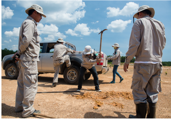
Quang Tri Province, Vietnam, 2013 - A Project RENEW EOD team digs a shallow trench to contain a controlled demolition of an artillery shell.

Project RENEW's work. NPA is a major partner of RENEW and, in addition to supporting the work in Quang Tri, also works in Thua Thien Hue Province further south. I came back to Vietnam in 2014 to spend a week near the ancient city of Hue and photograph NPA's work there.