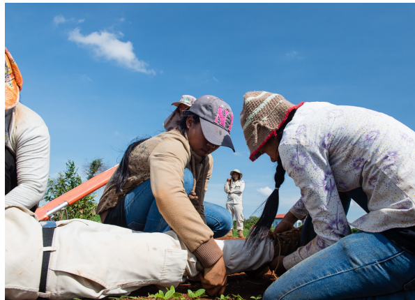
Ban Lung, Ratanakiri Province, Cambodia, 2014 - An NPA deminer supervises a group of new recruits performing a first aid drill in the field behind the NPA compound.

still but travel to different places. She said others see the NPA women in uniform doing demolitions and admire the women as strong: the community had not seen women do this kind of work before. She wanted to stay in NPA “forever.”