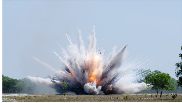
Quang Tri Province, Vietnam, 2013 - A controlled demolition conducted by an EOD team from Project RENEW.