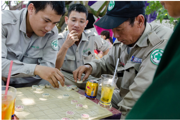
Thua Thien Hue Province, Vietnam, 2014 - After completing the day's ordnance destruction, they go for nonalcoholic drinks at a local café and play checkers.