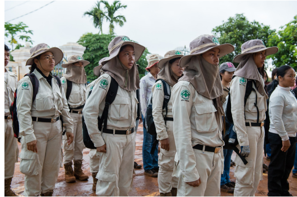
Ban Lung, Ratanakiri Province, Cambodia, 2014 - Early in the morning, the two NPA all-female EOD and survey teams deployed in Ratanakiri Province in Northeast Cambodia line up at the NPA compound for the day's briefing before being driven to their mission.