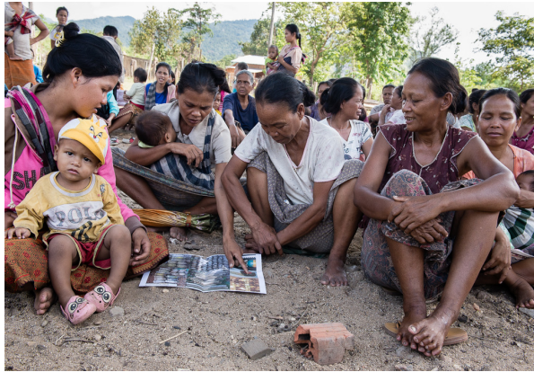
Attapeu Province, Lao PDR, 2014 - Laotians who live near the village of Mixai attend a community meeting to hear a presentation about the dangers of cluster munitions and other UXOs and to report to NPA whether any of them have seen explosives in the village. NPA relies on tips from local residents to locate mines and UXOs and plan their search efforts.

The results of a nontechnical survey are analyzed using GPS maps and computer modeling; areas which show no sign of contamination can be released for public or private use, while evidence of suspected hazardous areas will lead to a technical survey. Using GPS and computerized maps, NPA sends out trained deminers with metal detectors. They will sweep 25 square meter boxes to locate any metal, then carefully excavate the ground to see what is there. Generally the signal comes from harmless metal fragments, but sometimes it comes from a bomb, a mortar round, an artillery shell, or land mine. In many locations, NPA has shifted to using highly trained detection dogs which can search much faster than human deminers, with near-perfect accuracy. NPA is now using small commercially available drones as well.