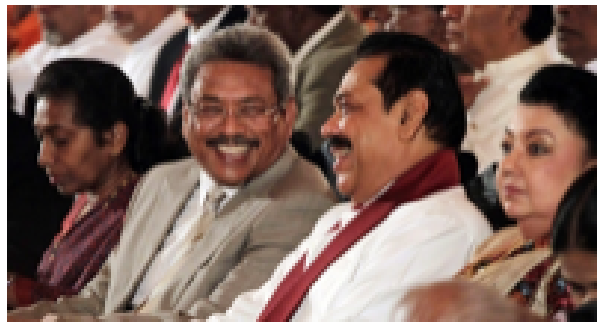
President Gotobhaya Rajapaksa (left) and former President Mahinda Rajapaksa

Court and the Sri Lankan Supreme Court ruled in favor of GR, opening the door for him to be elected. While he also had a host of other court cases ranging from misappropriation of state funds to bribery involving military procurement, these cases dragged on for months as GR's lawyers claimed that he was undergoing medical treatment in Singapore. The cases were still pending when he was elected president, but were withdrawn following his election since the president enjoys legal immunity.