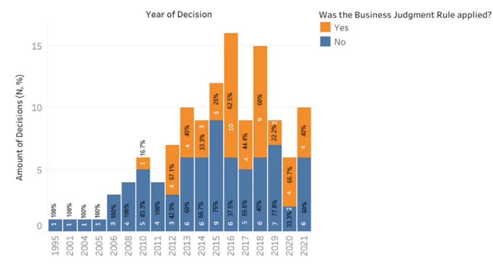
Figure 1. Distribution of Israeli court decisions where the BJR was mentioned (in blue) or applied (in orange) according to the year each decision was handed down.