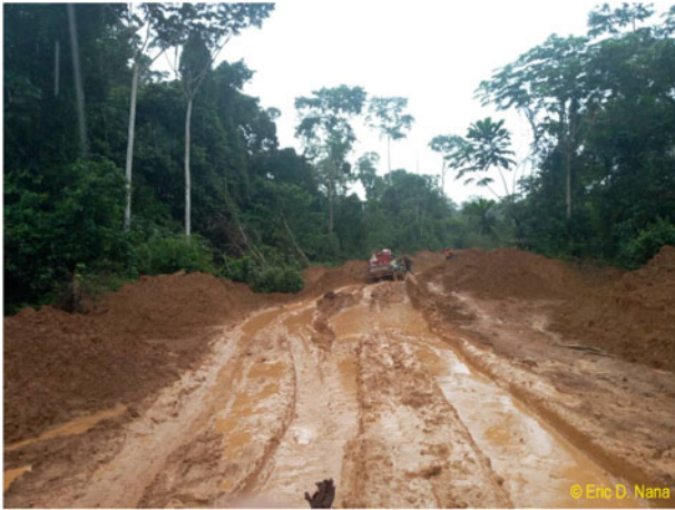
Cameroon government once more opens way for logging in the biodiversity rich Ebo Forest, a Key Biodiversity and Tropical Important Plant Area.

work because there are no law enforcement agents present to prevent large-scale poaching facilitated by logging. It is not a priority for logging companies. The management strategy of Conservation Enclaves within Forest Management Units needs revamping. We fear therefore that this decision will lead to extirpation of threatened and rare species such as Preuss's red colobus Piliocolobus preussi (with only two remaining populations, one of which is in the Ebo forest), the Goliath frog Conraua goliath (the largest living frog), the culturally unique Nigeria–Cameroon chimpanzee Pan troglodytes ellioti (which both fishes for termites and cracks nuts), and a potential new subspecies of gorilla occurring between the western lowland gorilla Gorilla gorilla gorilla and Cross River gorilla Gorilla gorilla diehli . One hundred and fifty-six threatened and 14 new plant species have been recorded in this forest since 2004 by the Royal Botanic Gardens, Kew and the National Herbarium of Cameroon.