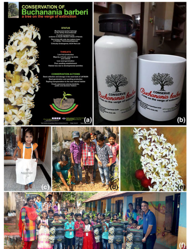
Conservation and education campaign for Buchanania barberi : (a) poster, (b) water bottle and mug, (c) bag, (d) seedling planting, (e) painting by Reema Abraham, (f) school awareness campaign.

Jawaharlal Nehru Tropical Botanic Garden and Research Institute has received funding from the Mohamed Bin Zayed Species Conservation Fund, UAE, to conserve B. barberi . In March 2022 and February 2023, we conducted education campaigns about the species, engaging key stakeholders such as the Forest Range Office in Palode, the Kerala Forest Department in Thiruvananthapuram, three schools (Government high school, Jawahar Colony; Upper primary school, Karimancode; Government lower primary school, Karimancode), and the local communities