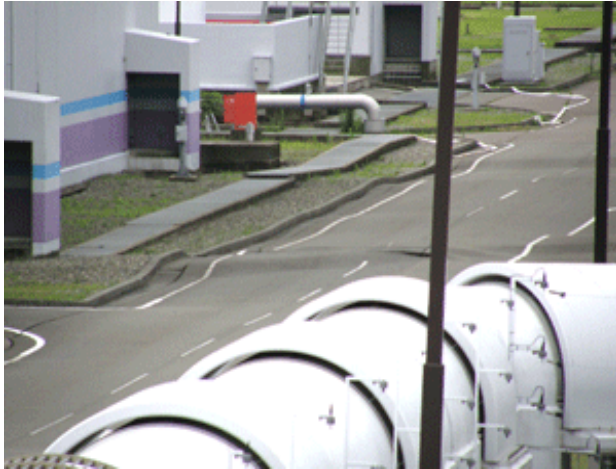
Buckled road at plant site

The bad news is that the crisis management systems at the plant proved inadequate and local authorities were not kept informed in a timely manner so that they could respond effectively. For nearly two hours TV viewers watched black smoke billowing out of the complex as plant staff abandoned fire hoses due to a lack of water pressure caused by damaged underground water pipes. Eventually local firefighters were called in, but their response was delayed by poor communications and damage to the access road caused by soil subsidence. The soil subsidence—as much as 1.6 mtrs in some places—also caused other water leaks into a reactor building and caused the fire by damaging an electrical generator; leaking oil from the transformer was ignited by sparks from a short circuit.