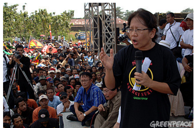
Antinuclear rally on June 13, 2007

Such arguments have not silenced opponents, who point out that only last year an earthquake in southern Java killed more than 5000 people.