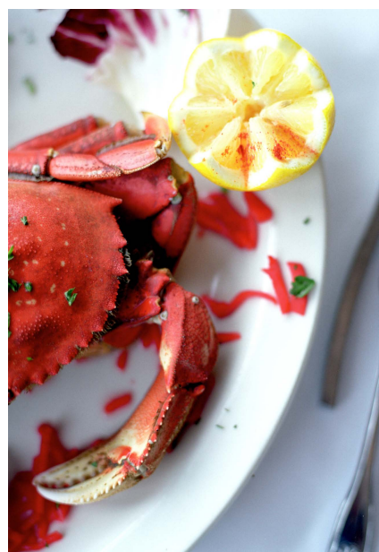
San Francisco is known for its fine dining and diverse culture.

Each year, on the Wednesday prior to the start of the Annual Meeting, APSA hosts half- and full-day short courses that provide opportunities for meeting attendees to enhance knowledge and reinvigorate teaching or research skills. Short courses are only open to registered Annual Meeting attendees and preregistration is required. View details on the Annual Meeting website's short course page: http://web.apsanet.org/apsa2017/short-courses/ . ■