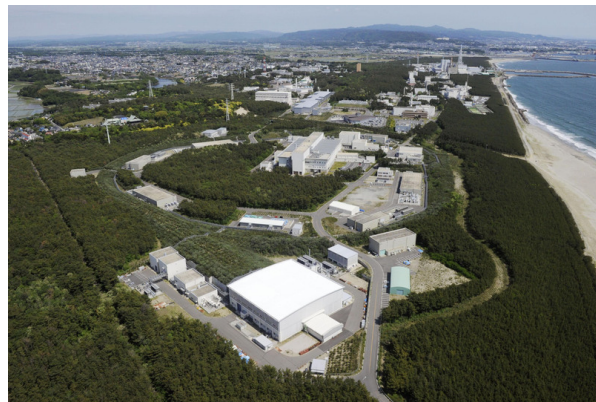
Tōkai nuclear power plants

MURAKAMI: Exactly. I saw this tendency more and more, and felt uncomfortable with it.